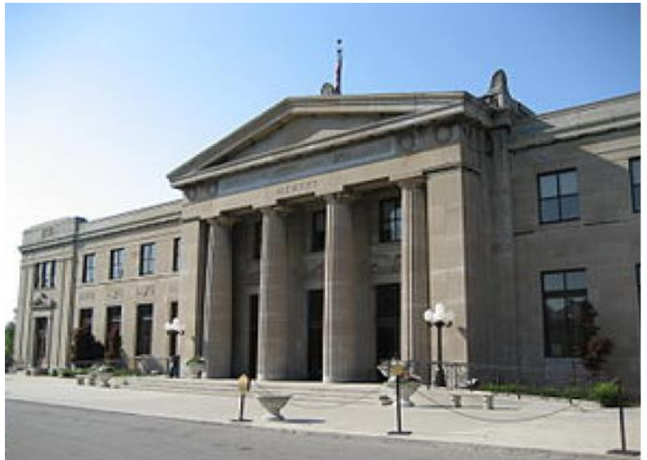
Liuna Station was a primary location for the feature film 'Stockholm'

The first three quarters of 2017 have been positive with respect to the film industry in Hamilton with several large scale productions choosing Hamilton for a majority of their principal photography. Productions such as the Lifetime TV Movie Flint starring Queen Latifah and the Feature Film Stockholm starring Ethan Hawke, Mark Strong and Noomi Rapace have made Hamilton their home this year.