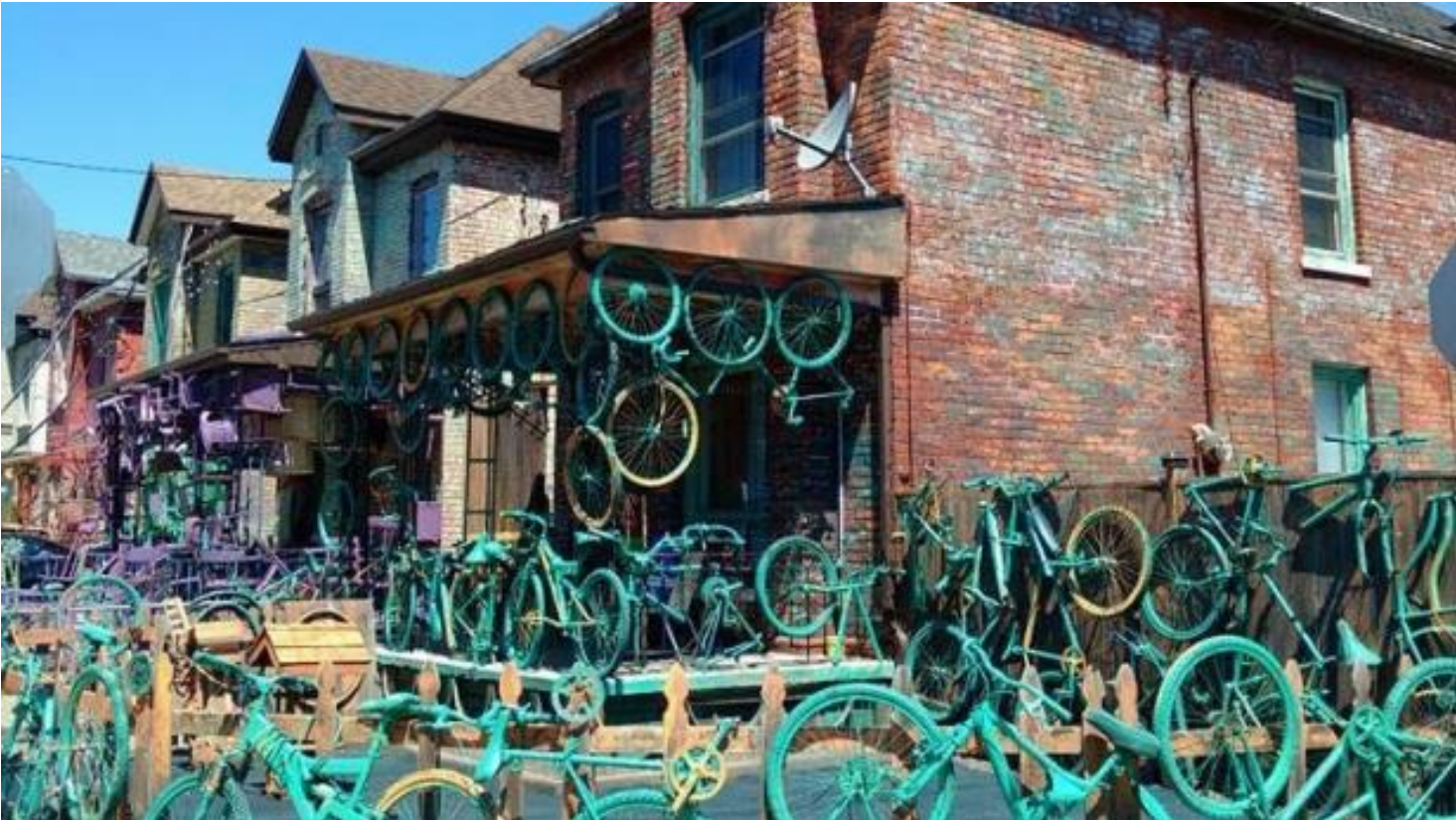
Keith Street decorated for Disney's Zombies