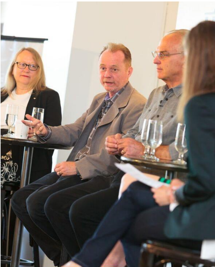
Film panel discussion, Hamilton Consulate