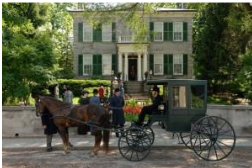
Murdoch Mysteries at Whitehern Historic House & Garden