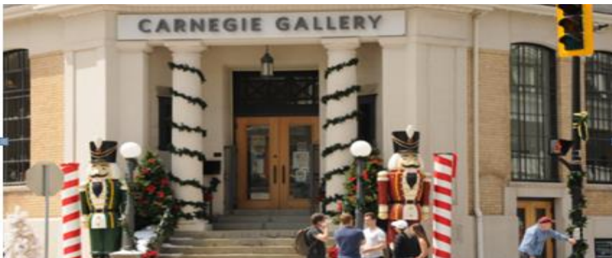
Hallmark TV Movie 'Home for the Holidays'