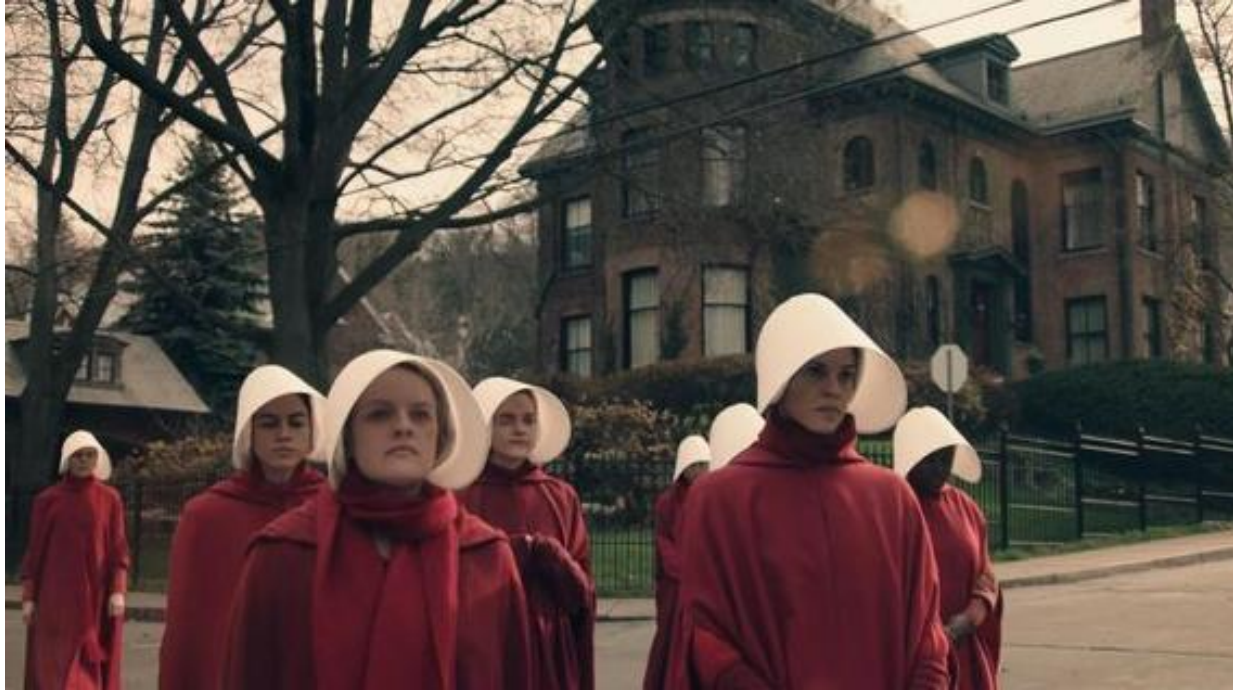
Still from the series ' The Handmaid's Tale '

Of the productions that have been welcomed to the City, some have been feature films and TV Movies however TV Series account for the greatest type of production annually within Hamilton. TV Series such as Taken, Designated Survivor, The Handmaid's Tale and Murdoch Mysteries have all used Hamilton to create their stories. As of September 30 th , 2017, 87 productions registered with the Hamilton Film Office with 37 being TV Series.