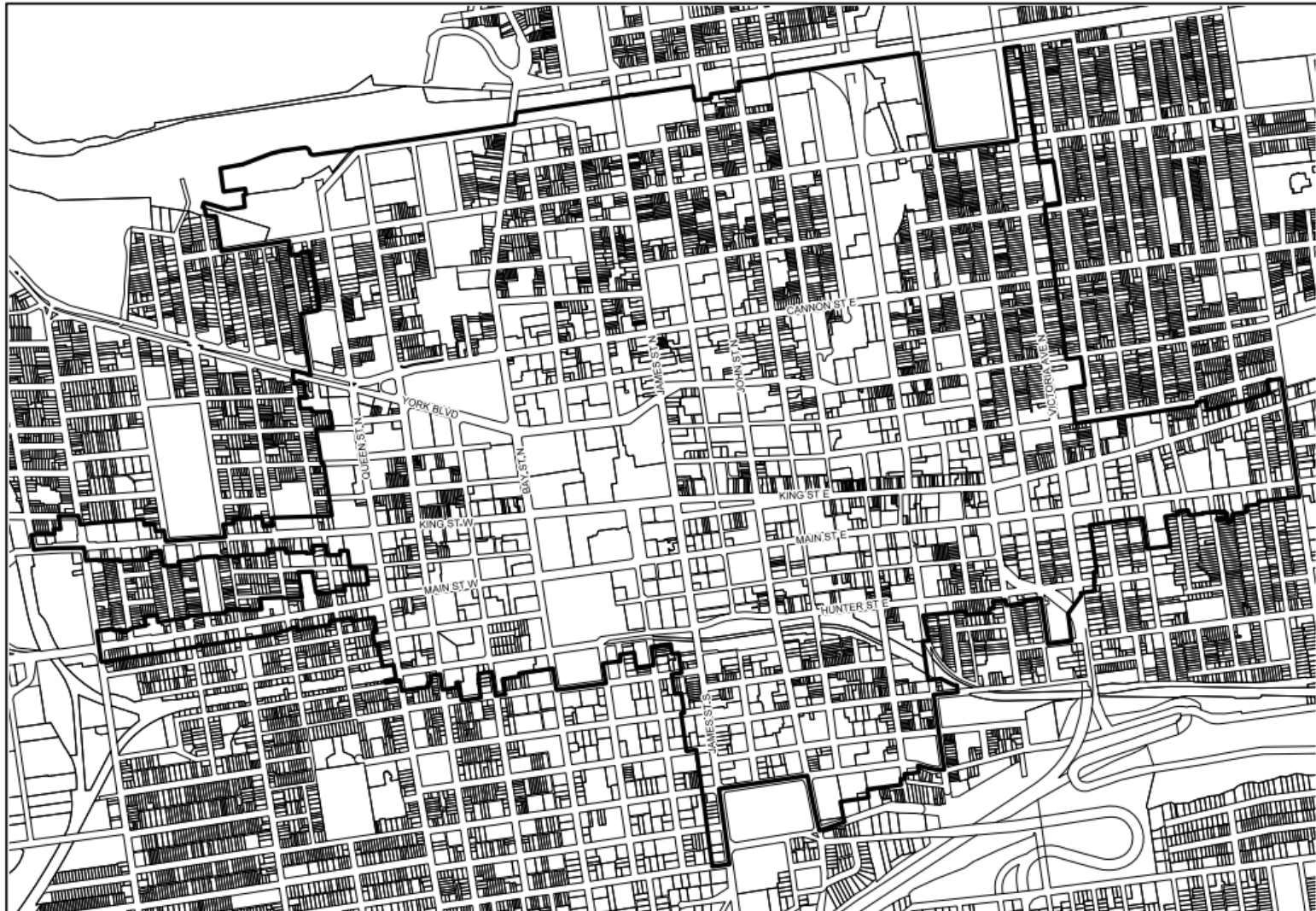
Schedule "A" Map Forming Part of By-Law No. 11-272 as amended by By-Law No. 13-028