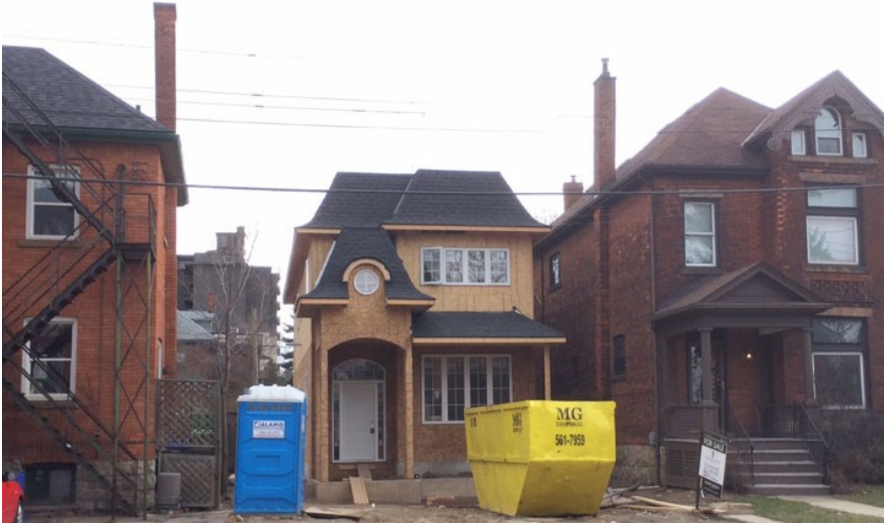
Infill on Queen Street – Development Charge of $35,465