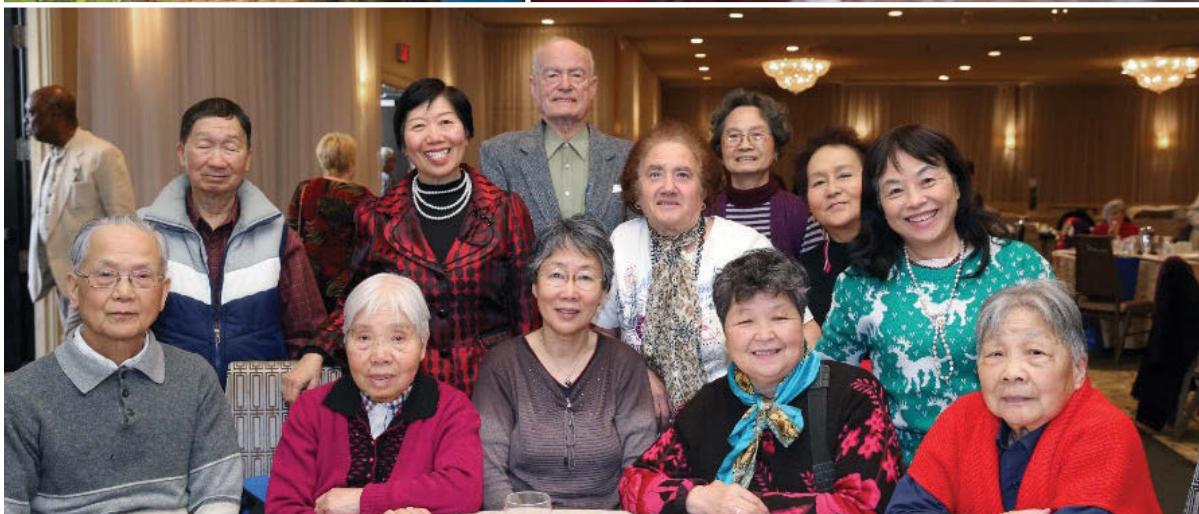
Age Friendly Symposium