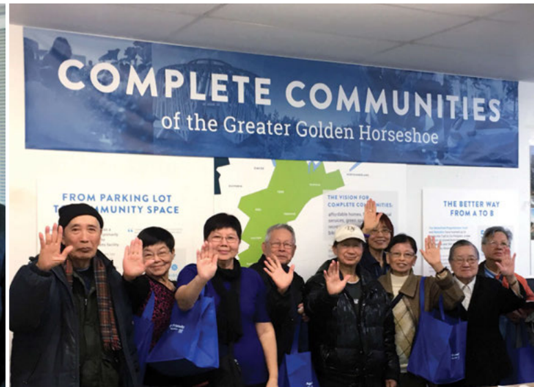
Pedestrian safety workshop