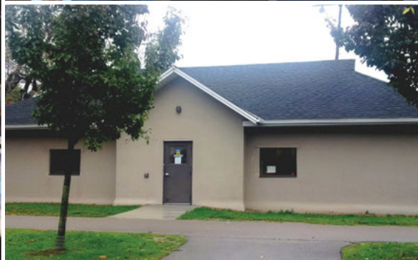
Victoria Park Clubhouse