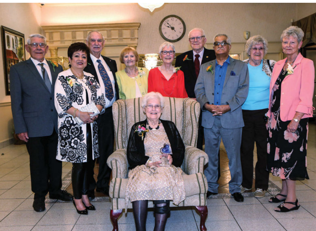
2017 Award Winners