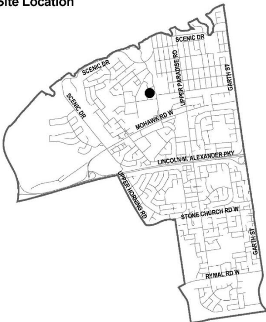
Key Map - Ward 14