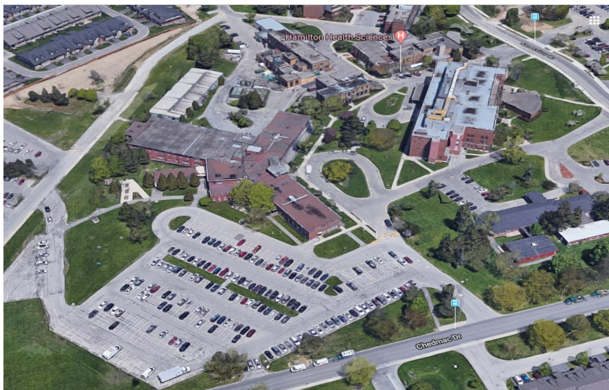
Existing Conditions – 555 Sanatorium Road – 8 Buildings