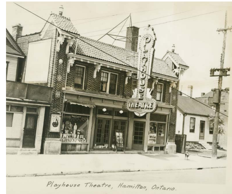
177 Sherman Avenue North, Hamilton, On. The Playhouse Cinema