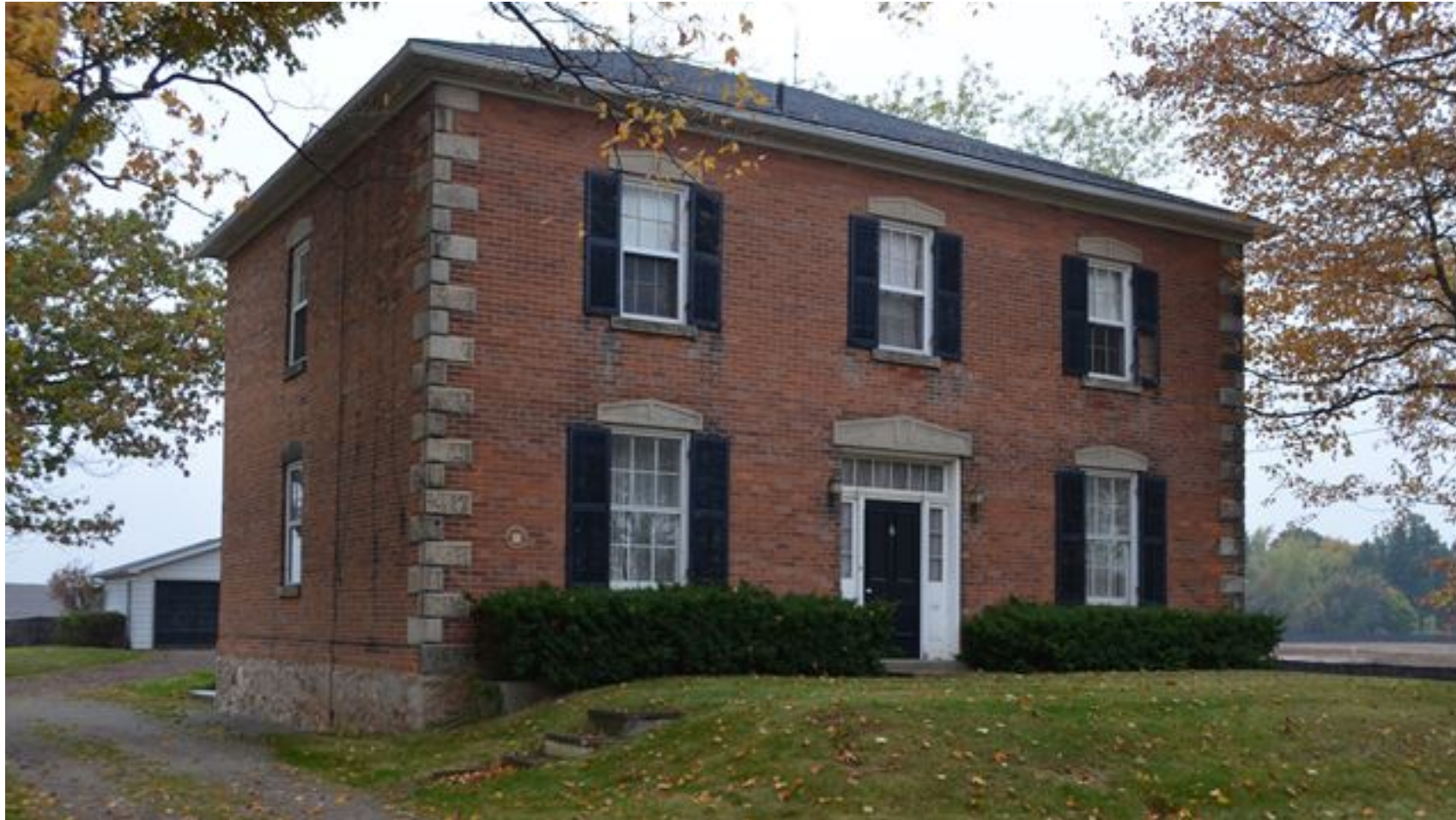
493 Dundas Street East, Waterdown, On. Pearson House