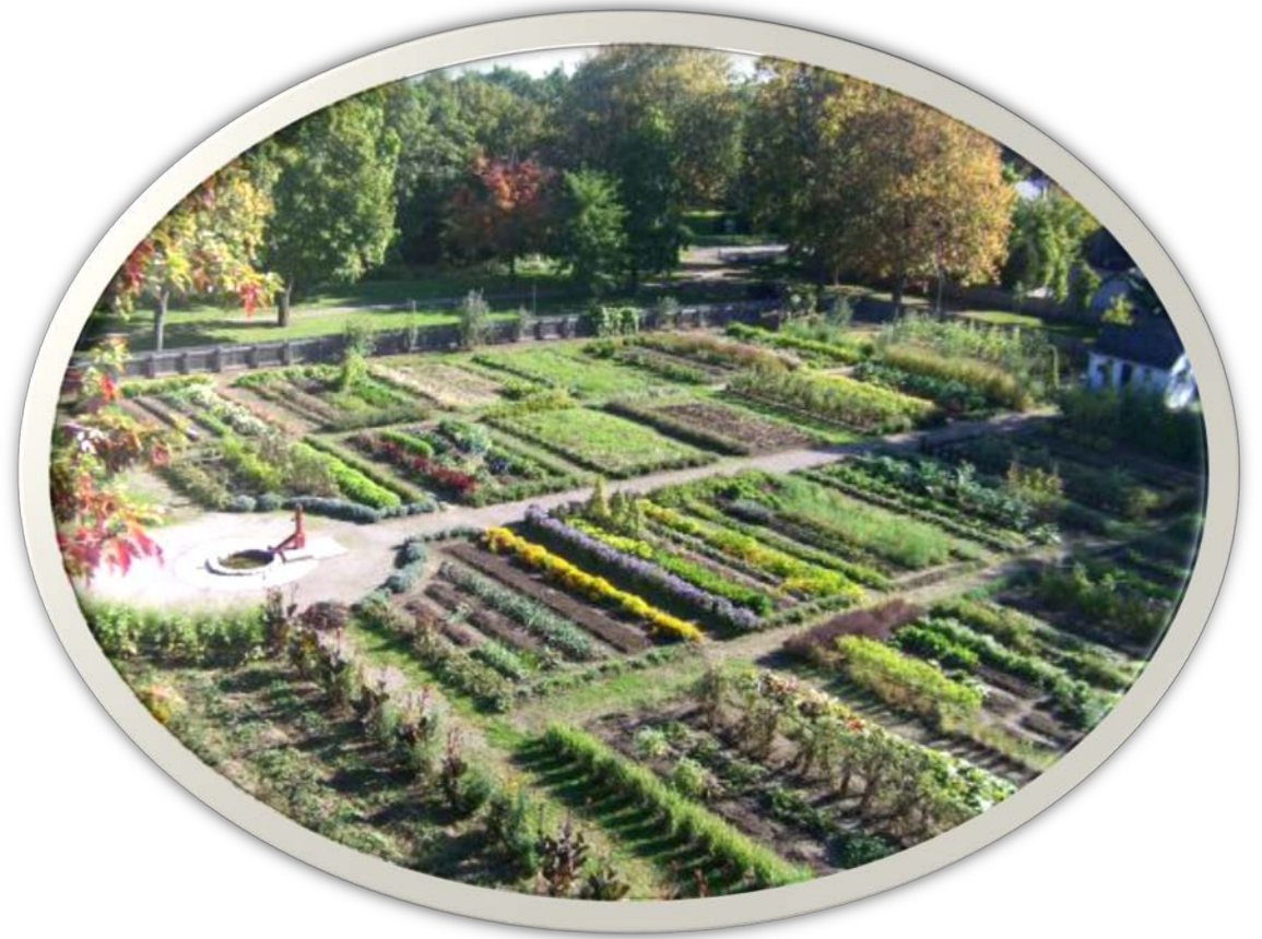
610 York Boulevard, Hamilton, On. Dundurn National Historic Site