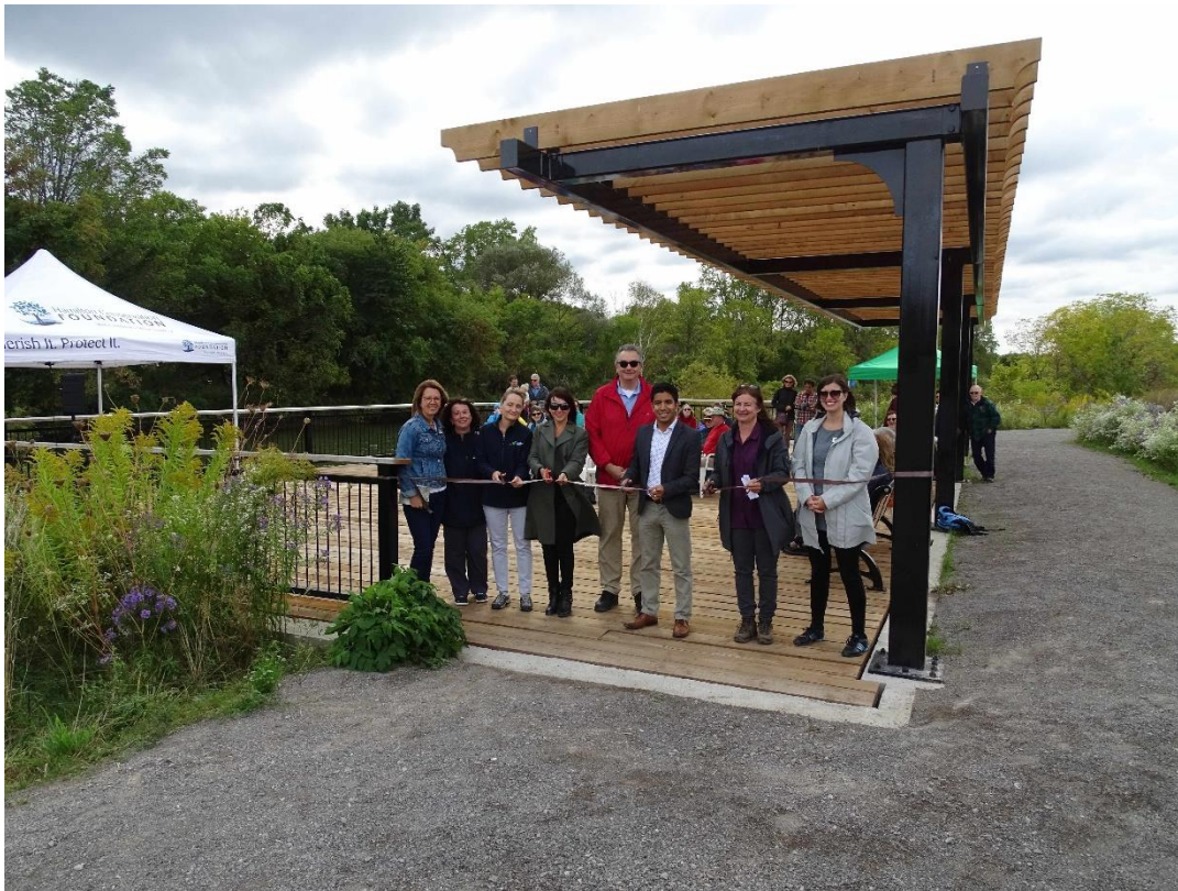
Canal Park Viewing Platform Ribbon Cutting – September 29, 2019