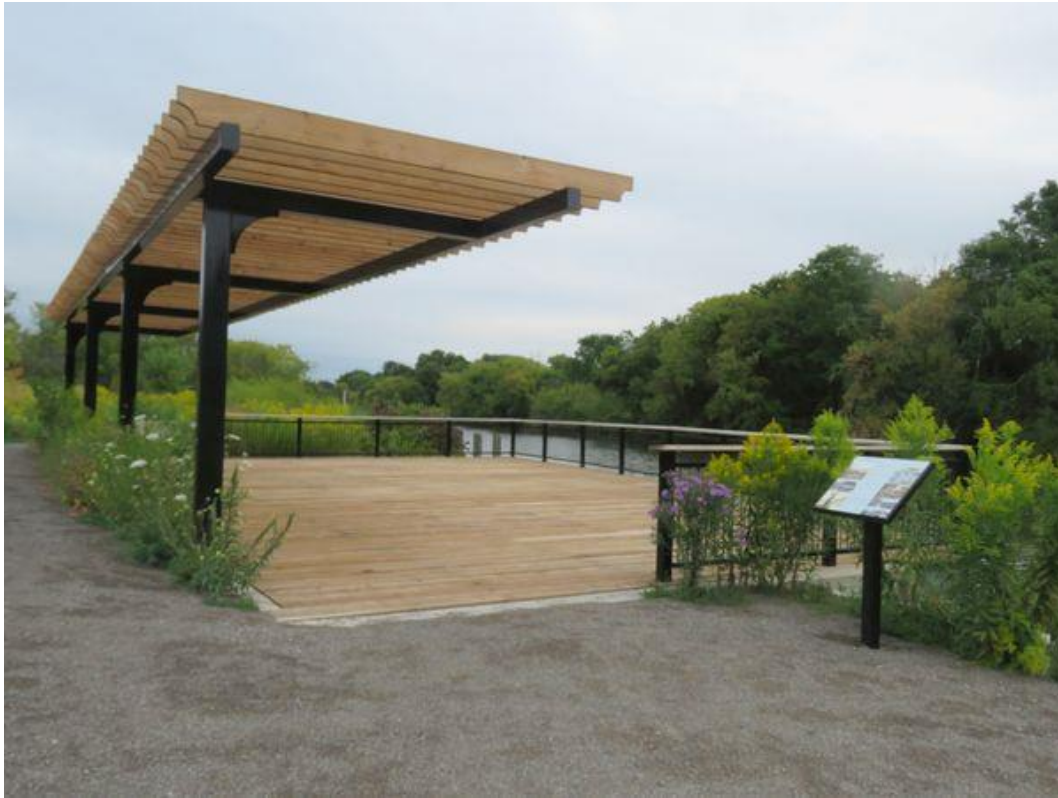
Canal Park Viewing Platform