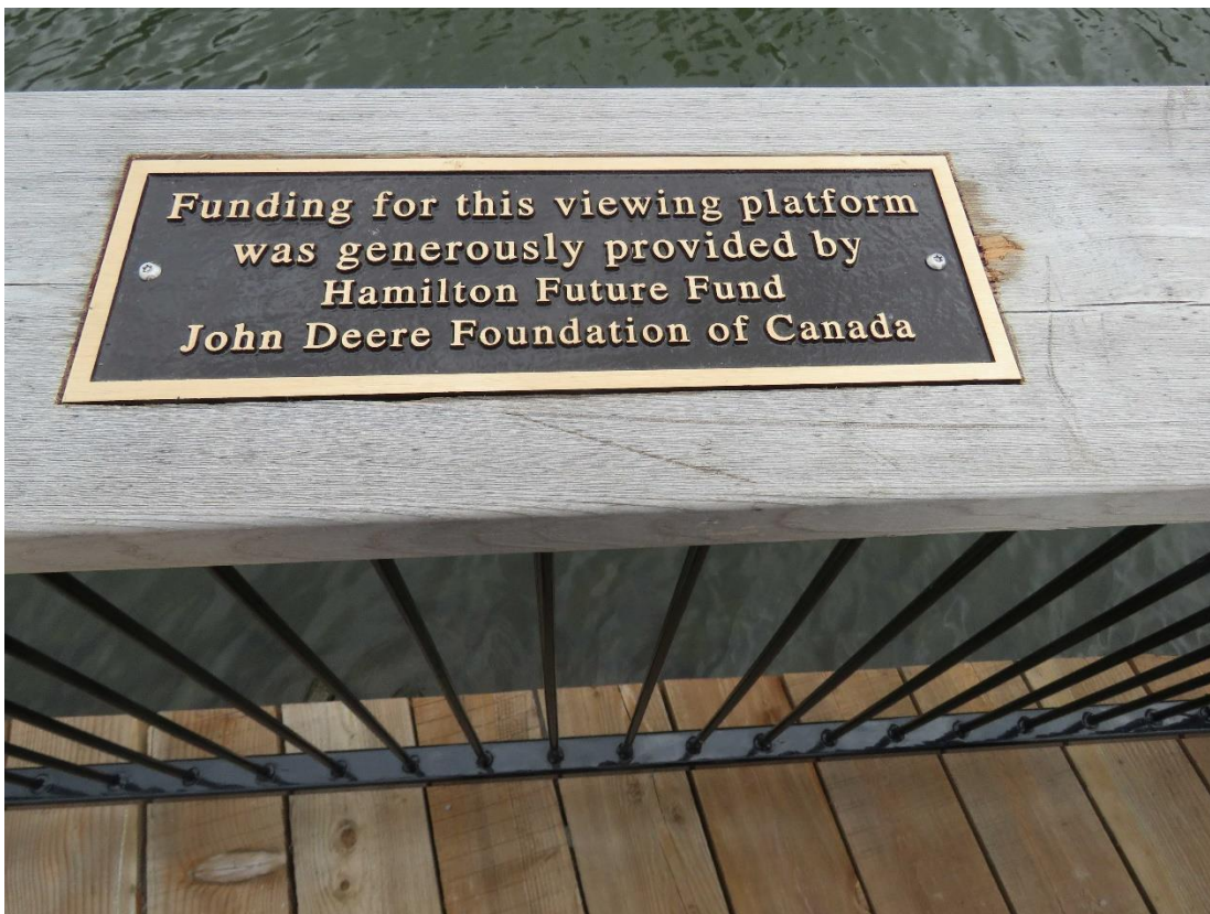
Canal Park Viewing Platform – Recognition Plaque