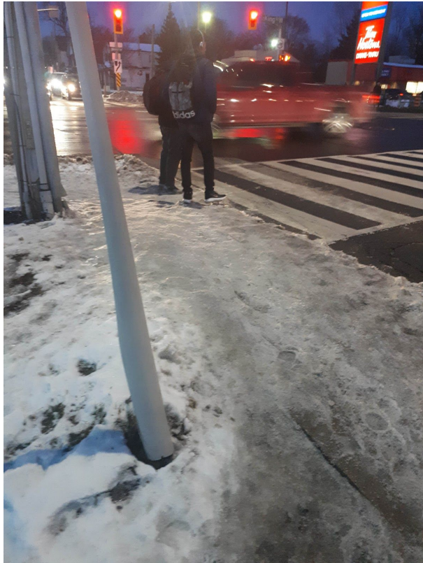
King at Dundurn.