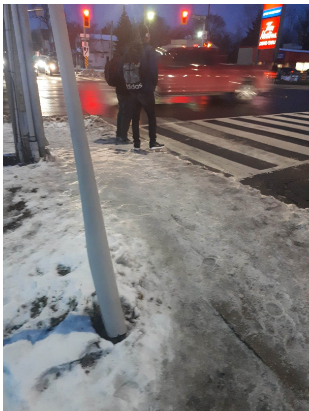
King at Dundurn.