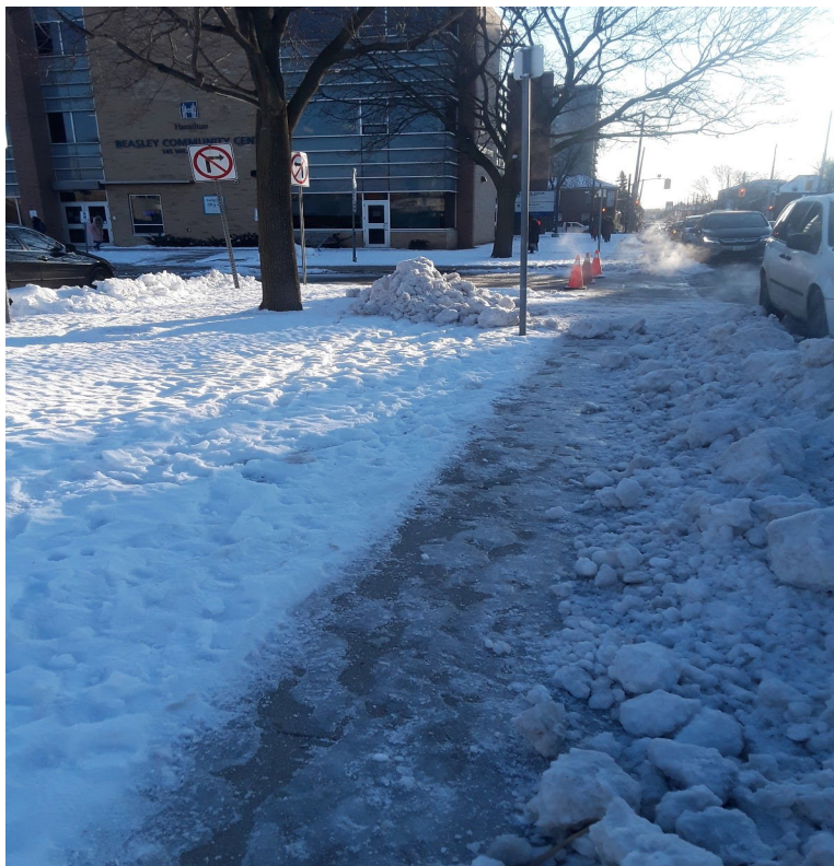
Dr. Davey Elementary School, Wilson St.

You are a student with a knee injury. Or a person in a wheelchair. Getting off the bus is going to be difficult, and embarrassing; how will you manage to navigate the pile of snow directly left by the road plows, directly where the bus pulls up?