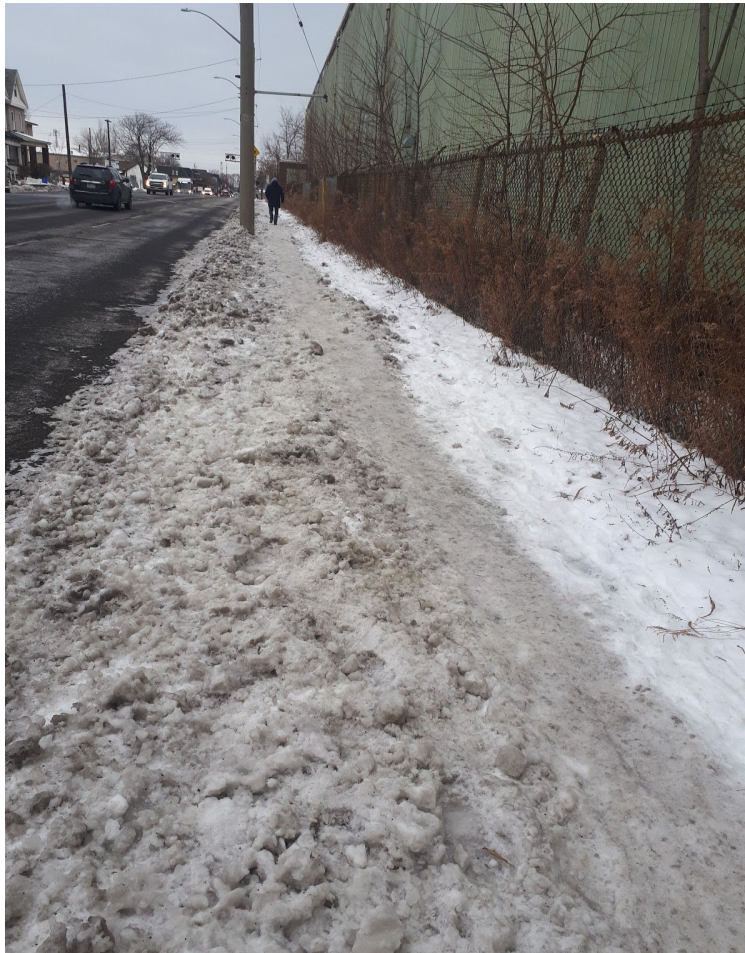
Wentworth st. N (by Empire Steel).

You are a senior, trying to decide whether or not you will attend the seniors' breakfast club at the Eva Rothwell Centre today. You haven't spoken to a single soul in days, and you could really use the food, but it's snowed again and the walk is treacherous; you fear you will slip. The last time it snowed like this, you had to walk on the road and you were almost hit by a car.