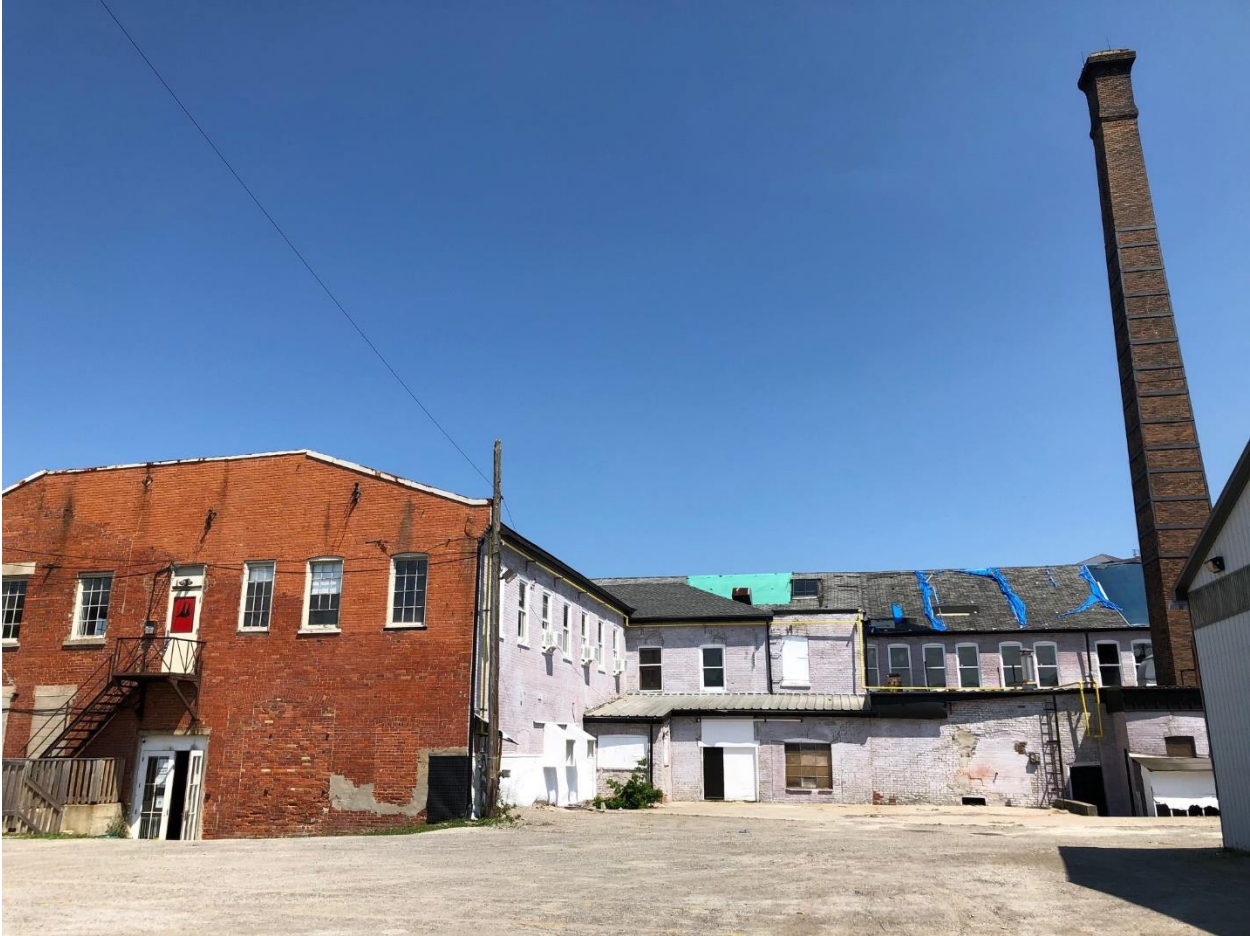
Current back-of-building view, with torn tarps and whitewashed brick (July 2, 2020)