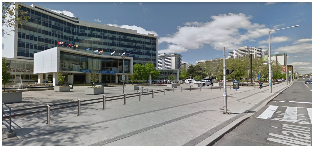
Option 2 (Fixed Bollards)