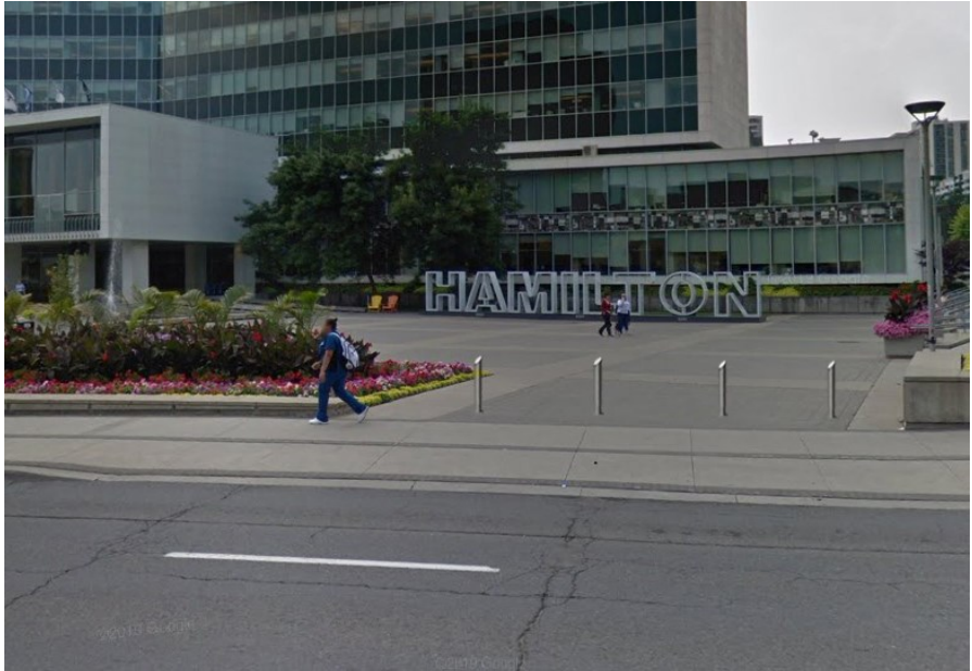
Option 1 (Removable Bollards)