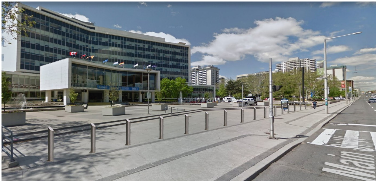
Option 1 (Removable Bollards)