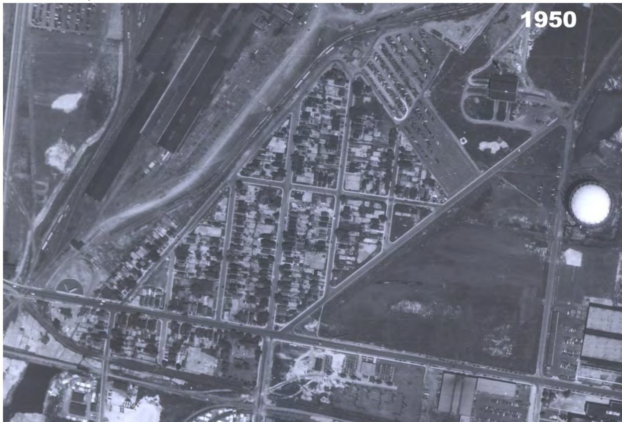
1950 Aerial photo

Developer's Advertisement, 1911 from: Craig Heron, Lunch-Bucket Lives: Remaking the Workers' City , (Between the Lines, 2016) p.47.