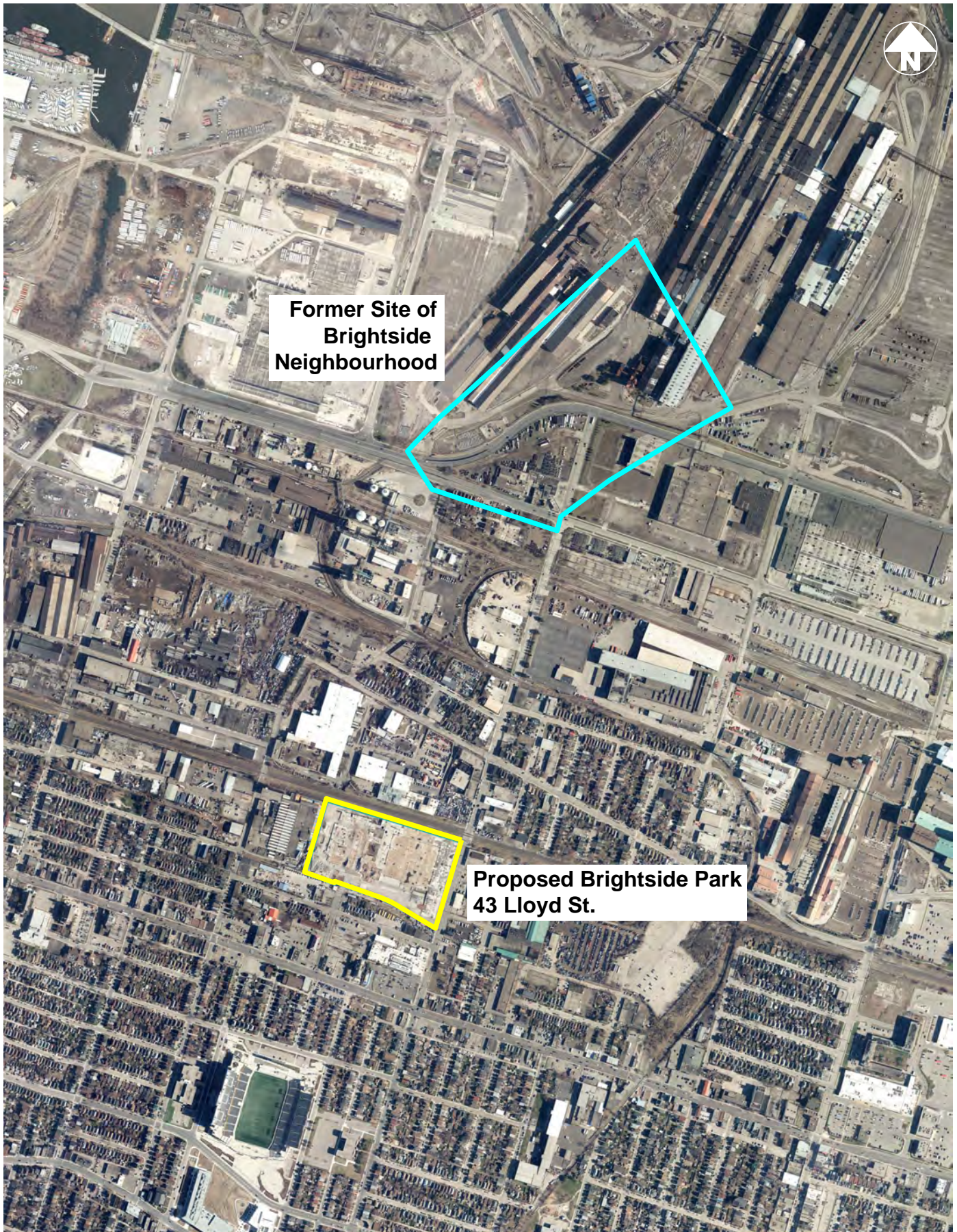
Proposed Brightside Park - 43 Lloyd St.