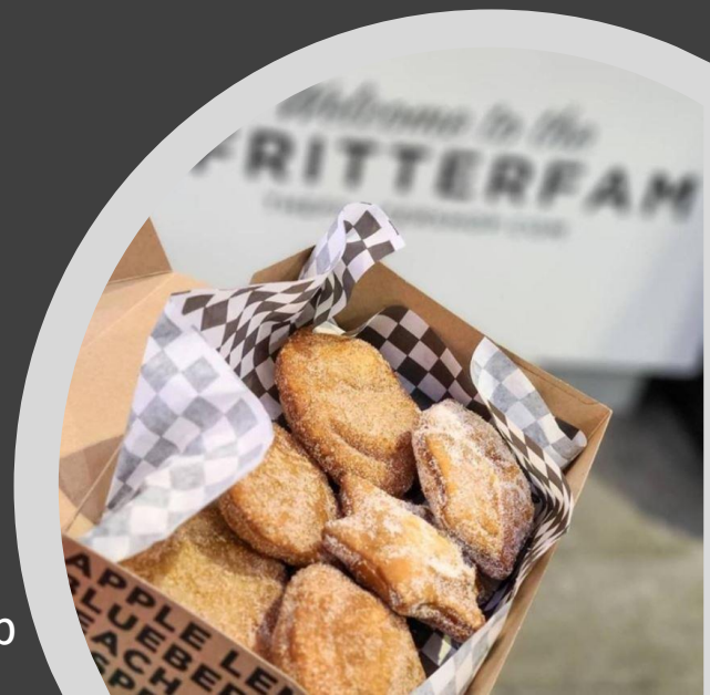
The Fritter Shop