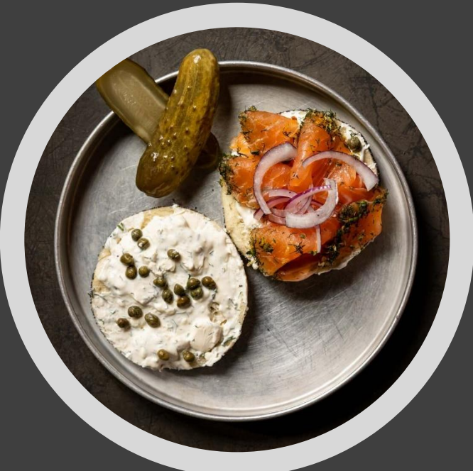
Joshy's Good Eats