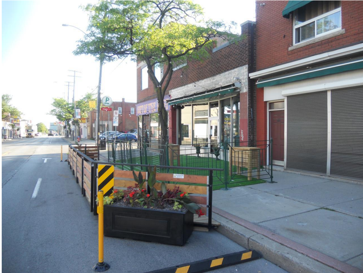
Image of a Pedestrian By-Pass Structure at The Argyle on Ottawa Street. The Patio area is on the sidewalk with the pedestrian by-pass structure in the parking space diverting traffic flow around the patio. The safety measures: Temporary Knock Down Bollard, Rubber Parking Stop Block, Yellow Delineator and Planter are shown.