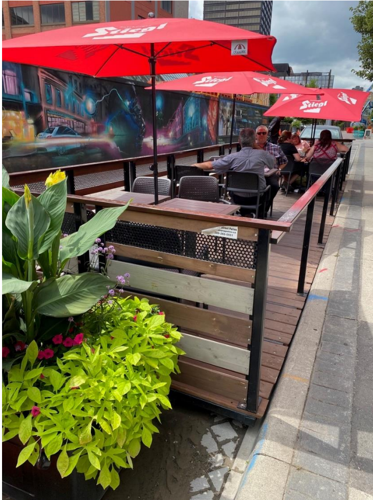
Image of an On-Street Patio at hambgr on King William Street. The wooden structure is located in the parking space with the sidewalk completely unobstructed. On the structure are tables (with patrons and umbrellas).