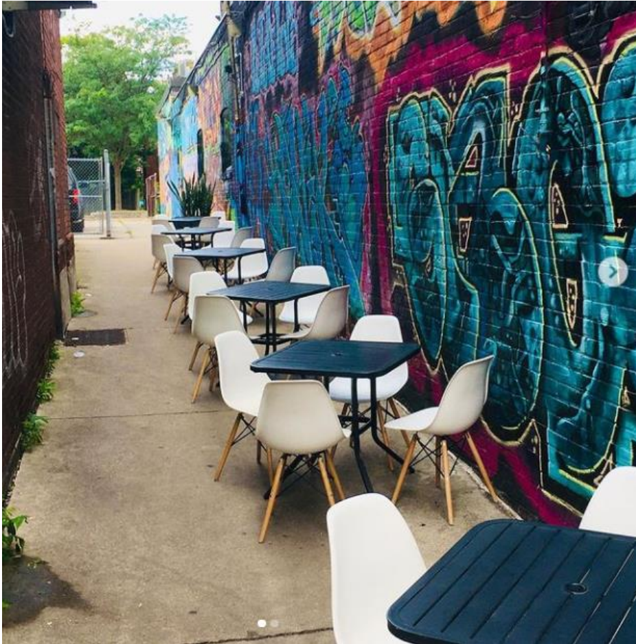
Image of the Caro alleyway patio just off James Street North. Tables are aligned along one side with an unencumbered walkway the entire length of the alleyway