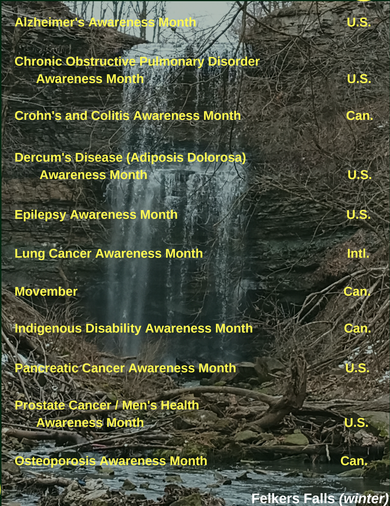
Felkers Falls (winter)