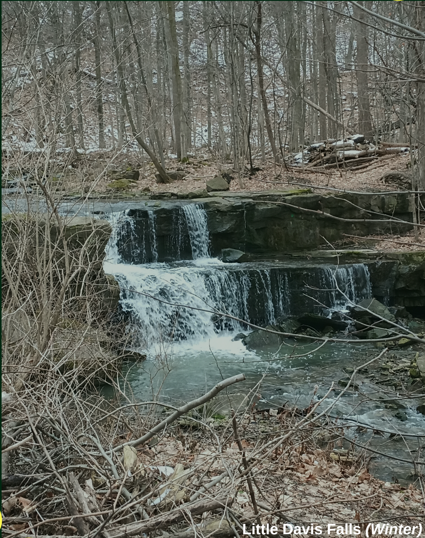
Little Davis Falls (Winter)