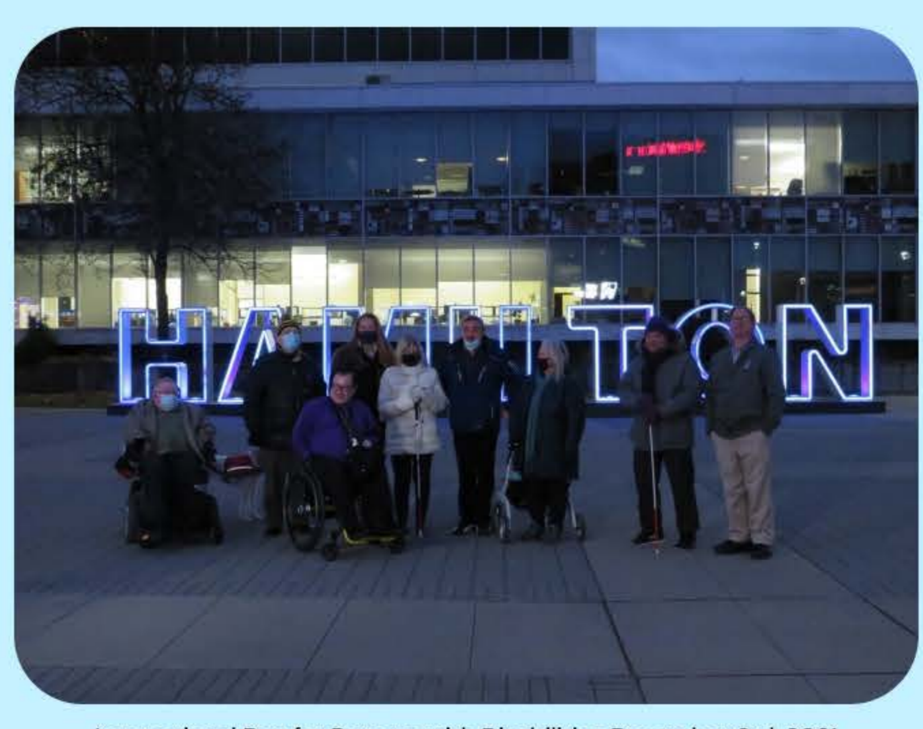
International Day for Persons with Disabilities December 3rd, 2021

For More Information Please Visit the ACPD Page on the Hamilton.ca Website