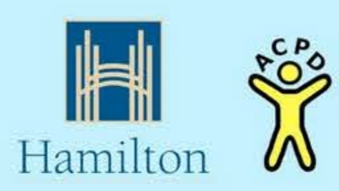
City of Hamilton's ACPD Logo

Home IDPWD About Us Where Participants Contact Us