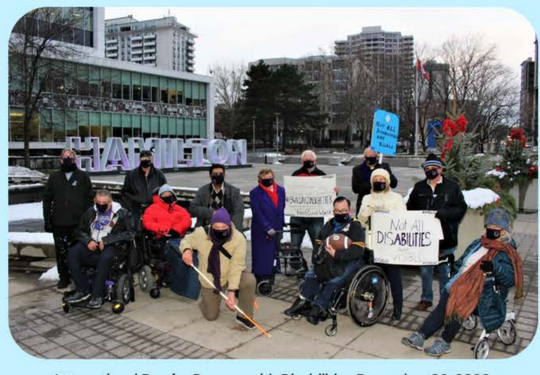
International Day for Persons with Disabilities December 03, 2020

The Advisory Committee for Persons with Disabilities is comprised of citizens of the City of Hamilton with a diverse range of disabilities that strive to consider the needs of all in order to make this city a more equitable, diverse and inclusive place to live.