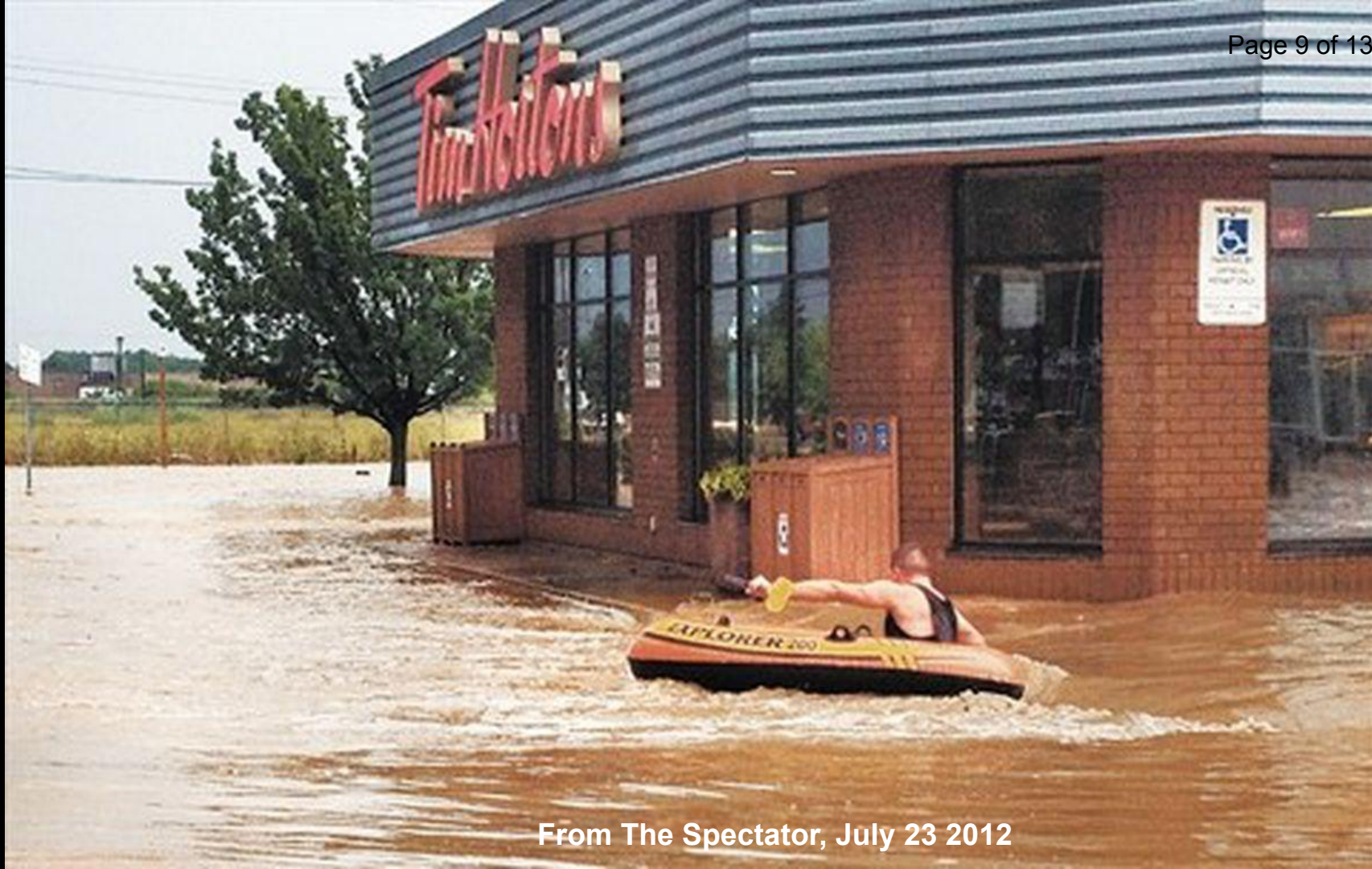
From The Spectator, July 23 2012