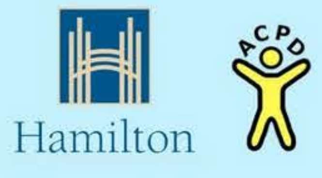
City of Hamilton's ACPD Logo

Home IDPWD About Us Where Participants Contact Us