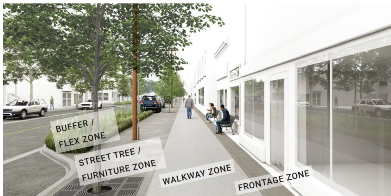
Figure 1: Illustration of Pedestrian Zones per Complete Streets Design Manual (p.54)

The Table for Pedestrian Zone Dimensions, on page 55 of the Complete Street Design Guidelines Manual, identifies a minimum desired width of 4.75m (2m walkway, 1.75m street tree/furniture, 0.5m buffer and 0.5m frontage zones) as being appropriate for the LRT corridor and accommodation of high levels of pedestrian traffic and users of mobility devices.