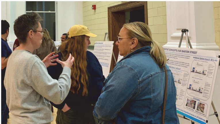
Barton Street Functional Study Public Engagement