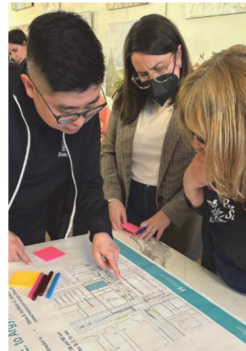
Ottawa Street Transportation Engagement