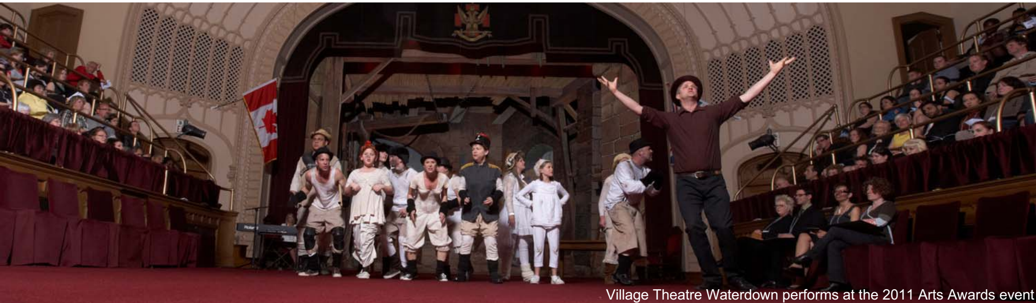
Village Theatre Waterdown performs at the 2011 Arts Awards event