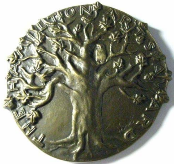
Arts Awards medallion by Dora de Pédery-Hunt