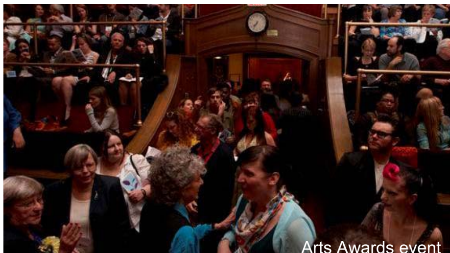
Arts Awards event

Jurors selected the strongest nominee based on three principle bodies of information: