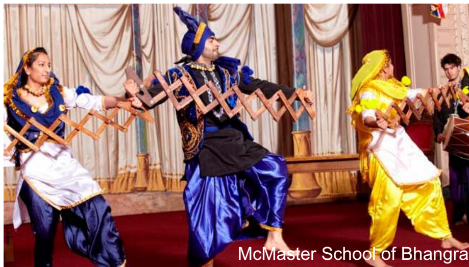
McMaster School of Bhangra