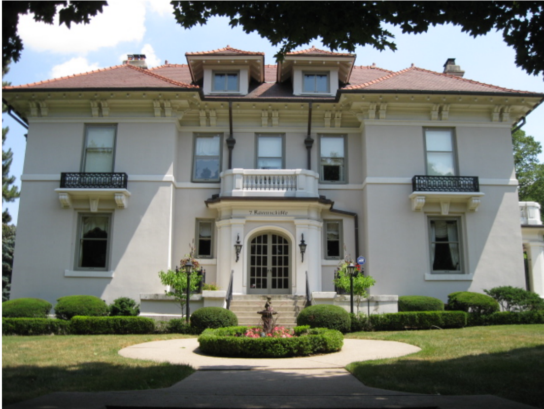
7 Ravenscliffe – West Elevation