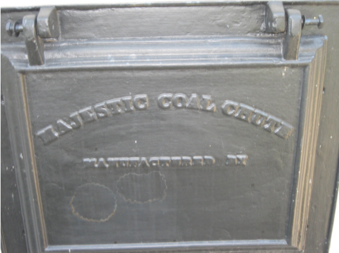
7 Ravenscliffe – Original coal chute on north façade