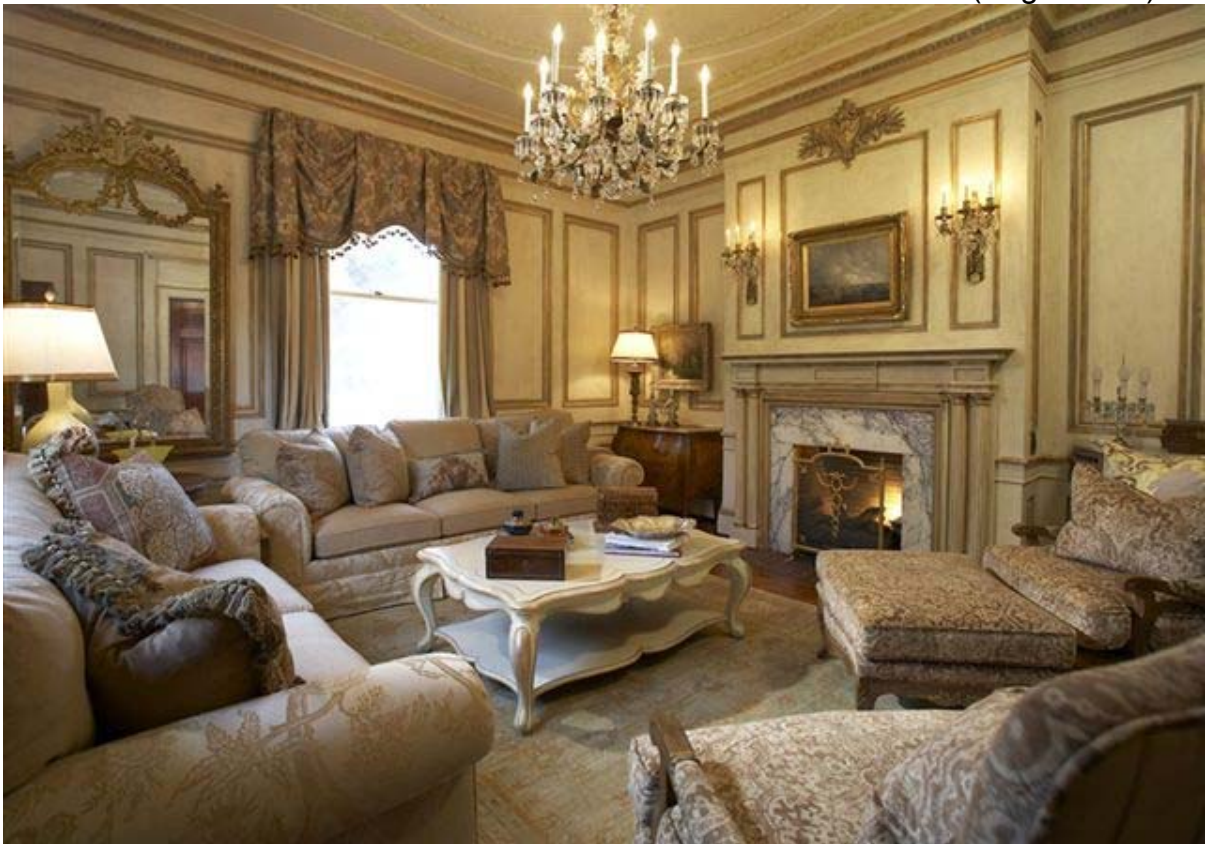
7 Ravenscliffe – Reception room