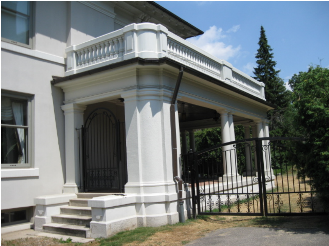
7 Ravenscliffe – South Façade