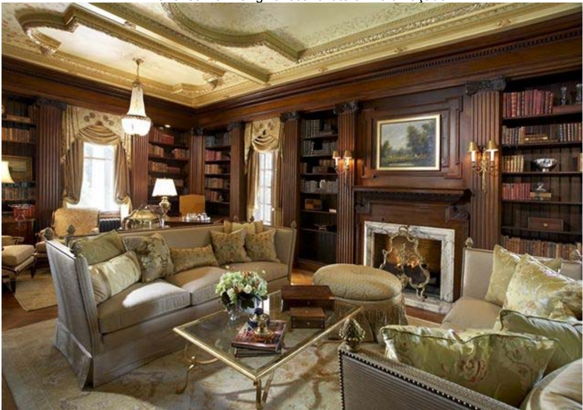
7 Ravenscliffe – Living room