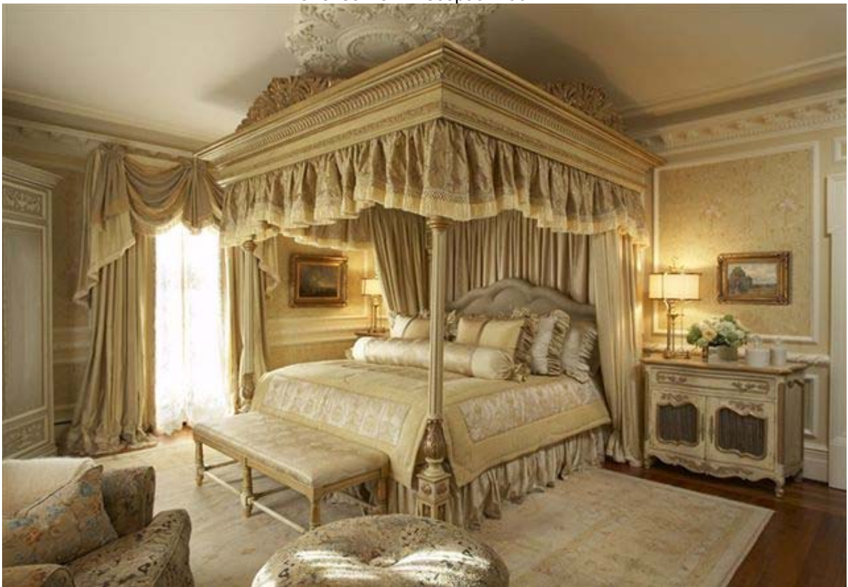
7 Ravenscliffe – Master bedroom