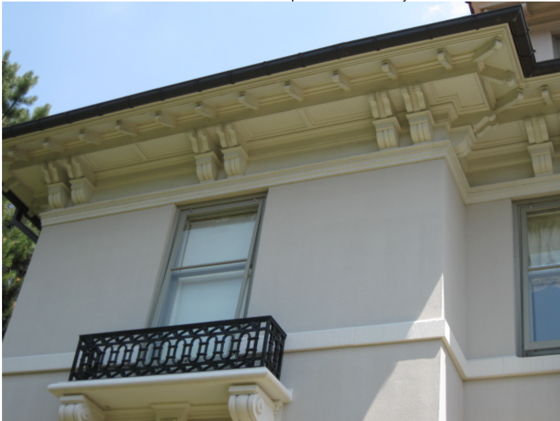
7 Ravenscliffe — Shaped corbels under roof and balconies