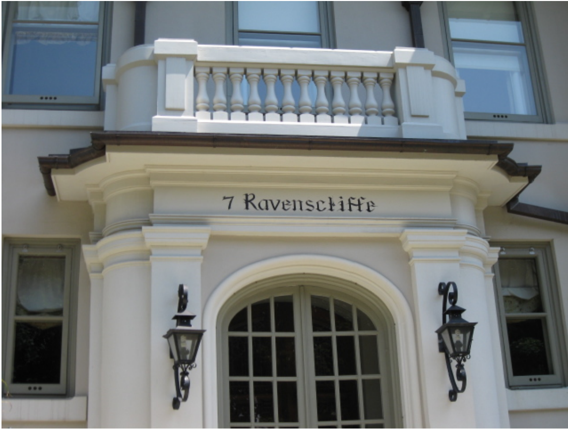
7 Ravenscliffe — Front portico with balcony