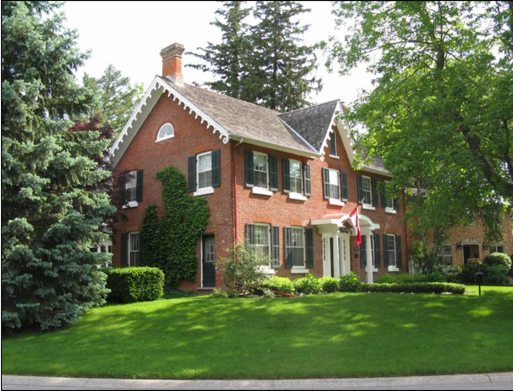
Front (South) and Side (West) Elevations