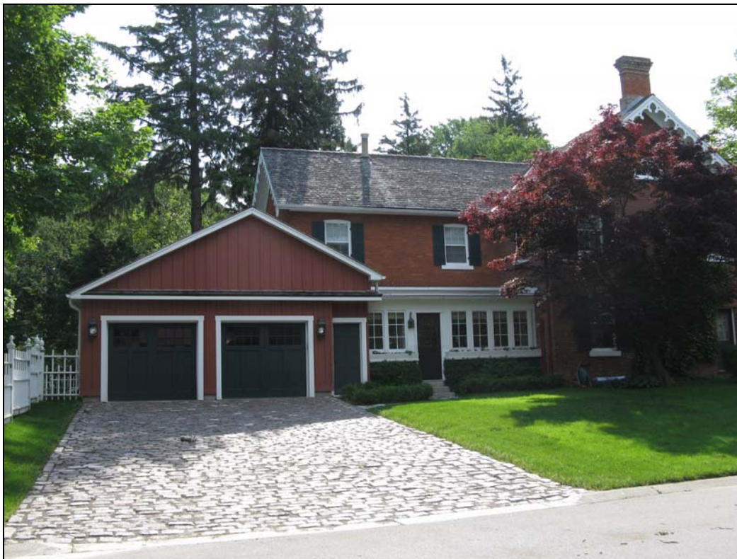
Side (West) Elevation