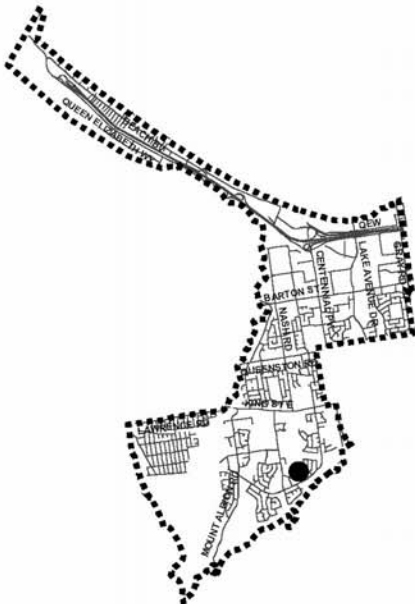
Ward 5 Key Map