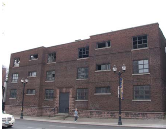
275 King Street West - Pre-development