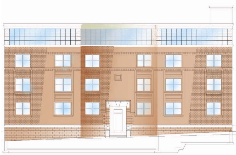
275 King Street West – Proposed Development

The pre-development and proposed-development of 275 King Street West are shown in the photographs above. Appendix 'B' to Report PED12033 identifies the location of the property within the Downtown Hamilton Community Improvement Project Area.