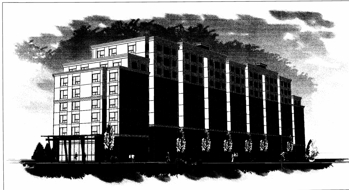
Ewen Road Apartments, Hamilton