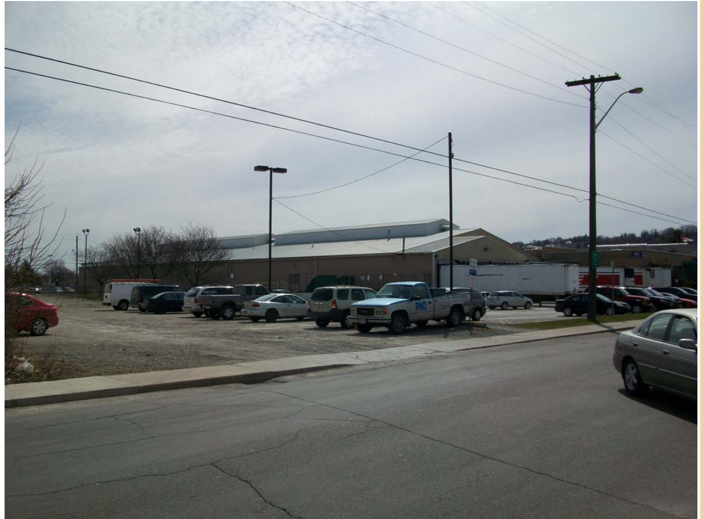
Photo 3 - View South from Ewen Road