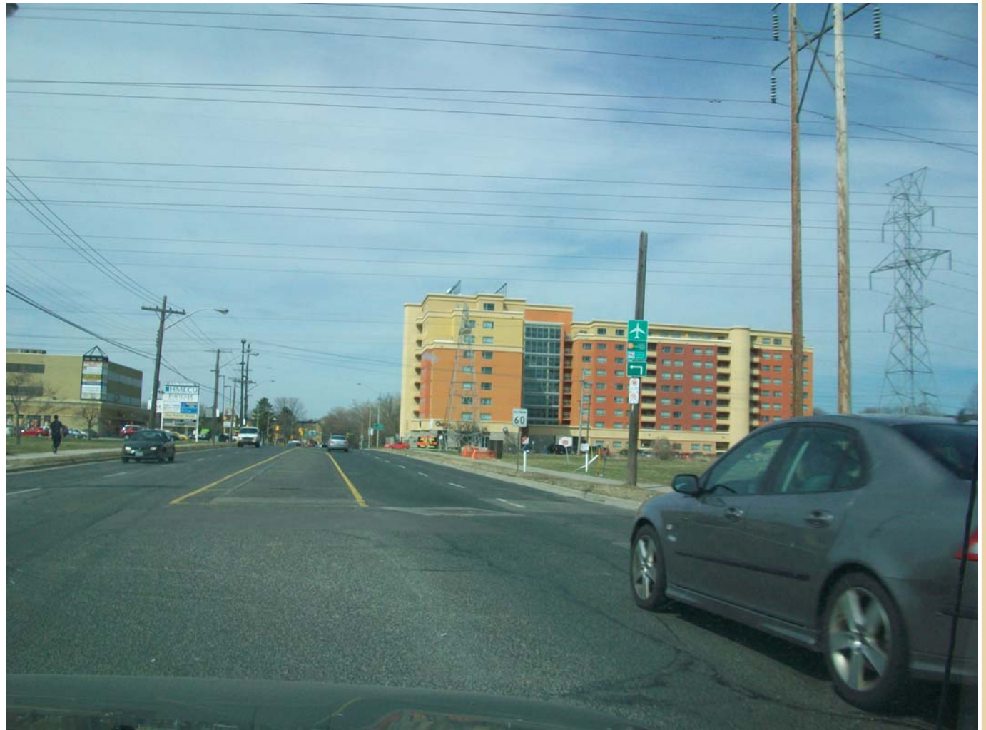
Photo 6 - View West along Main Street West