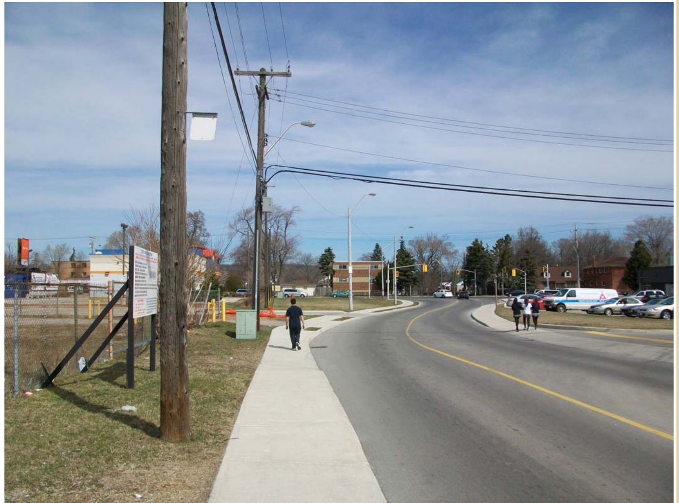
Photo 2 - View North from Rifle Range Road