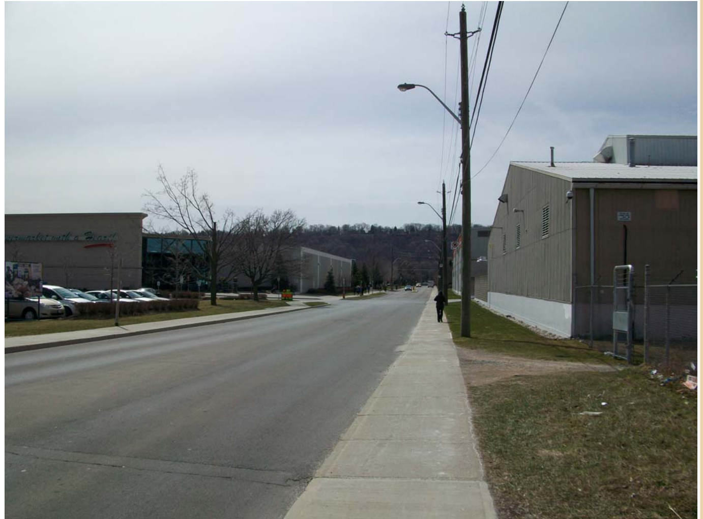
Photo 4 - View South from Rifle Range Road