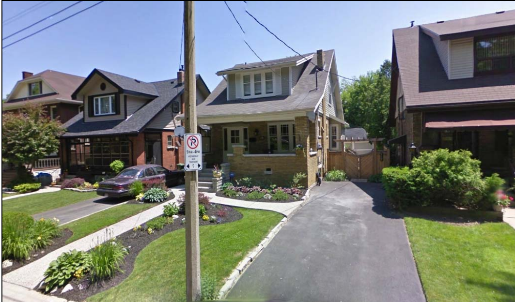
231 Saint Clair Boulevard (existing garage is behind the gate at the end of the driveway)