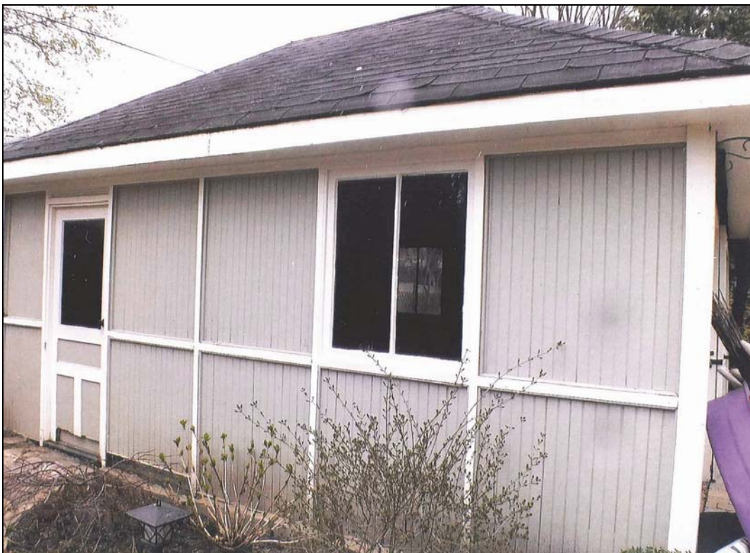
231 Saint Clair Boulevard (existing garage side elevation)