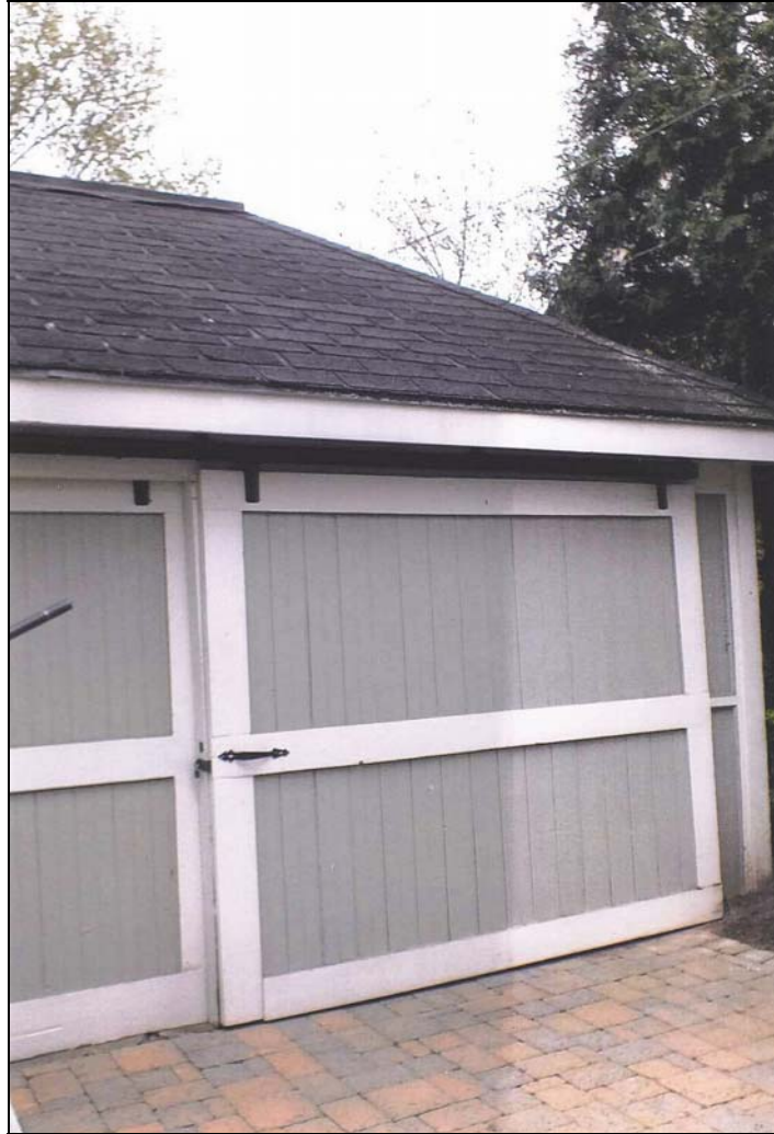
231 Saint Clair Boulevard (existing garage partial front elevation)