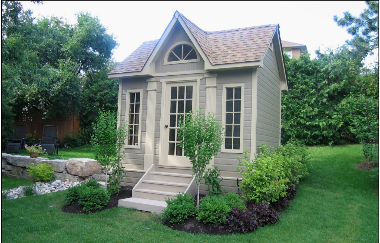
231 Saint Clair Boulevard (catalog example of proposed garden shed, but not elevated/without steps)