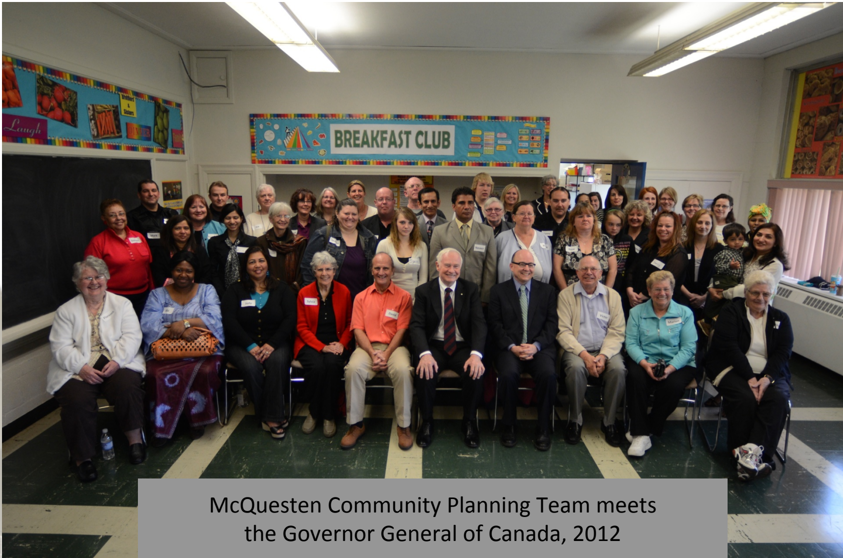
McQuesten Community Planning Team meets the Governor General of Canada, 2012