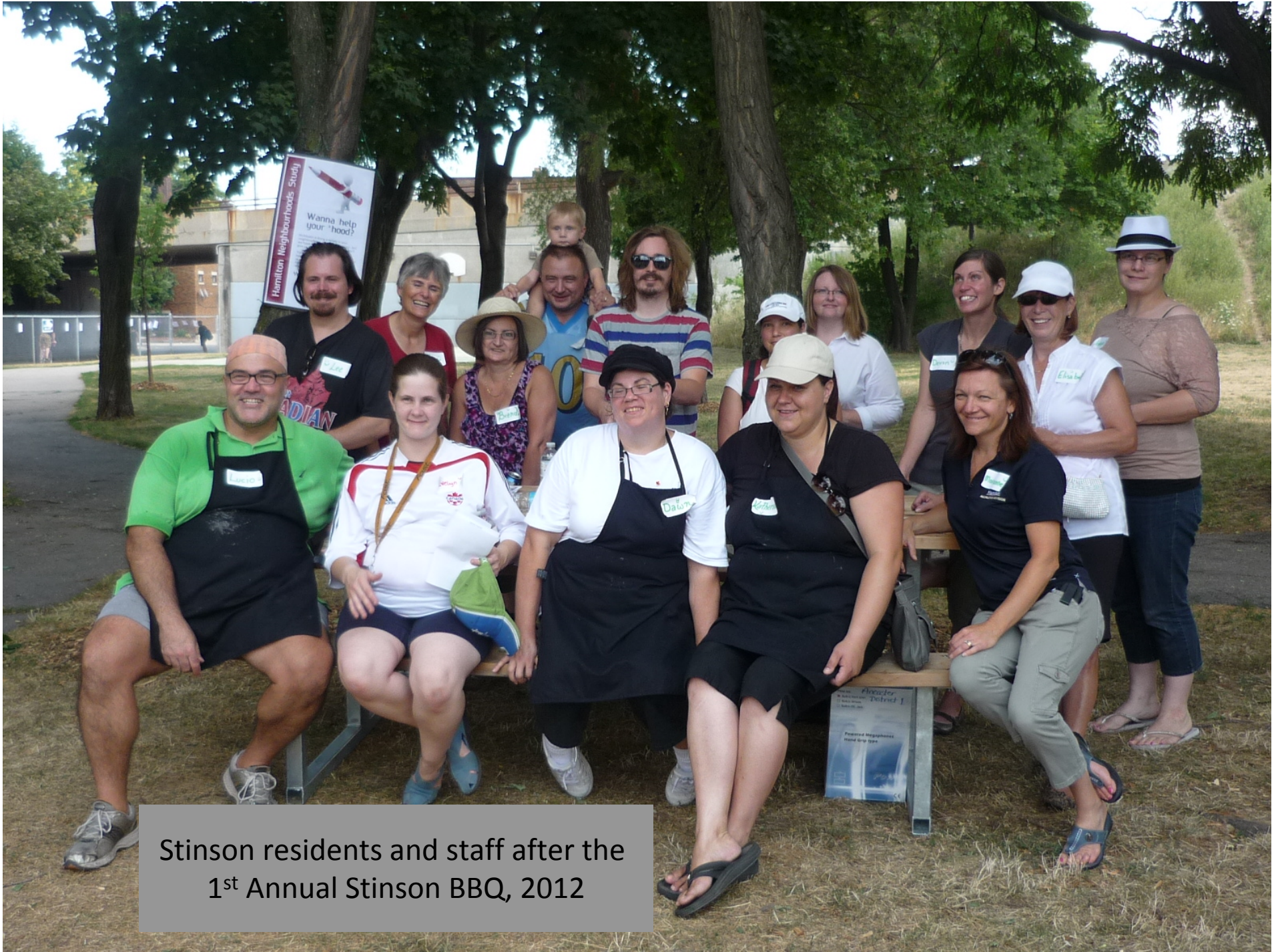
Stinson residents and staff after the 1 st Annual Stinson BBQ, 2012