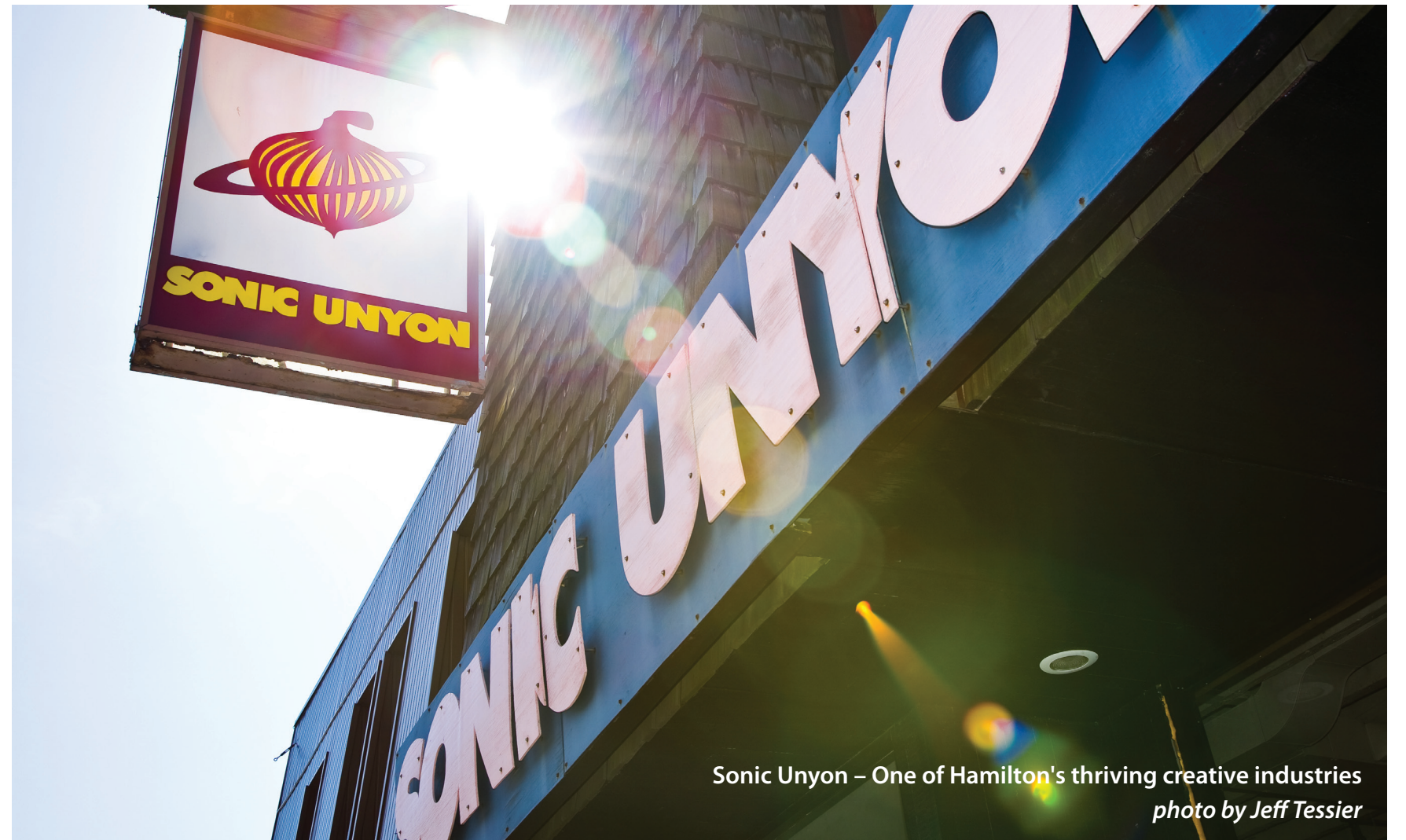
Sonic Unyon – One of Hamilton's thriving creative industries

Opportunities for economic growth within the tourism and culture sector exist. The new Tourism and Culture Division will be better positioned to seize these opportunities.