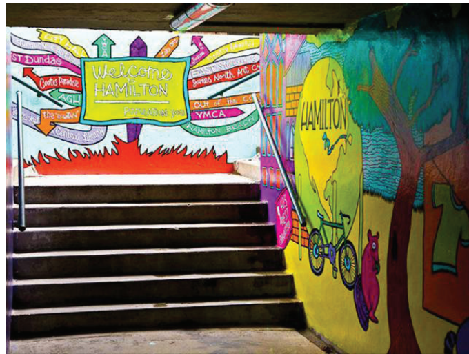
Welcome Hamilton Mural – MacNab St. Tunnel Downtown Hamilton

Similarly, the recently merged Tourism and Culture Division, as a new member of the Planning and Economic Development Department at the City of Hamilton, is ready to take the final steps in redefining itself .