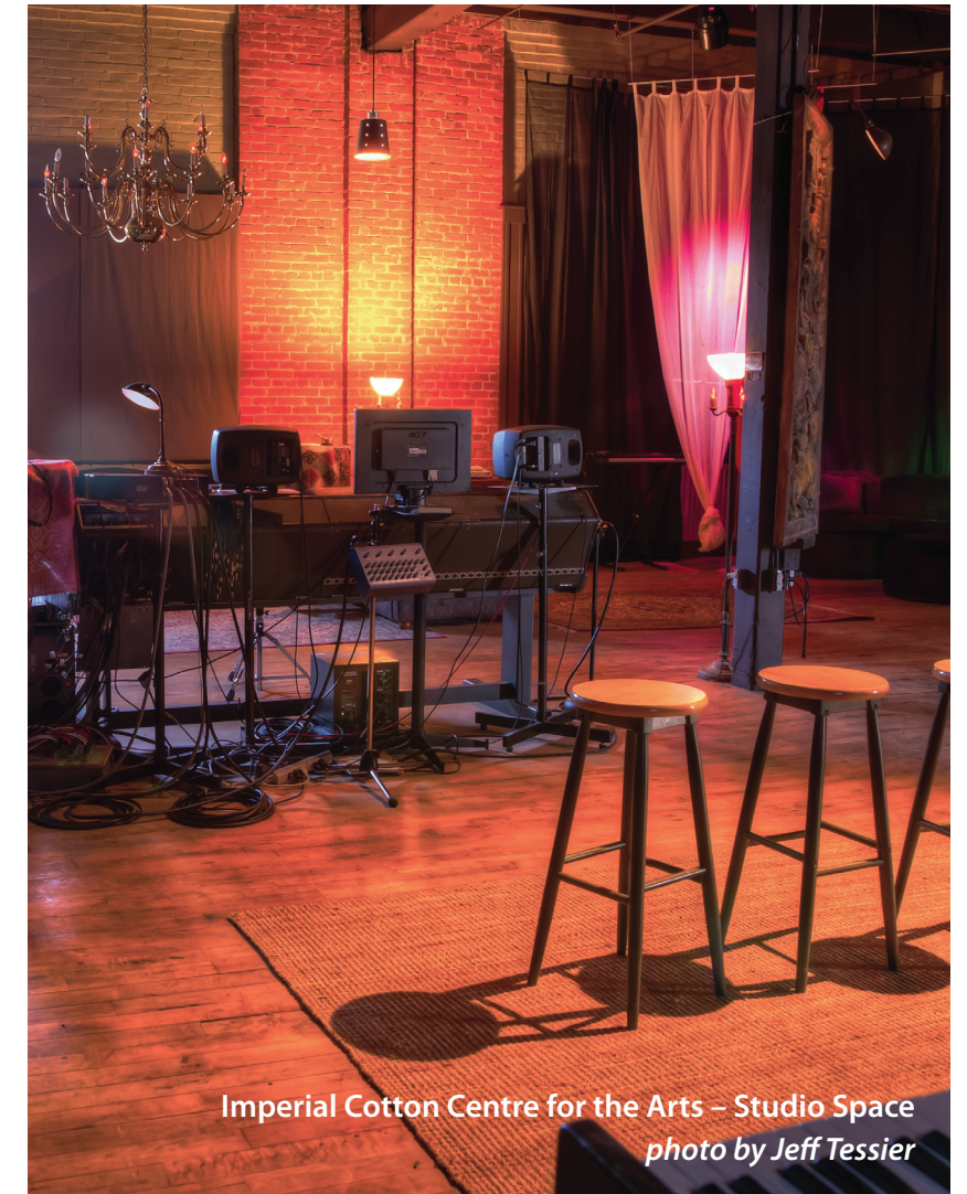
Imperial Cotton Centre for the Arts – Studio Space