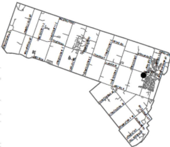
Ward 15 Key Map