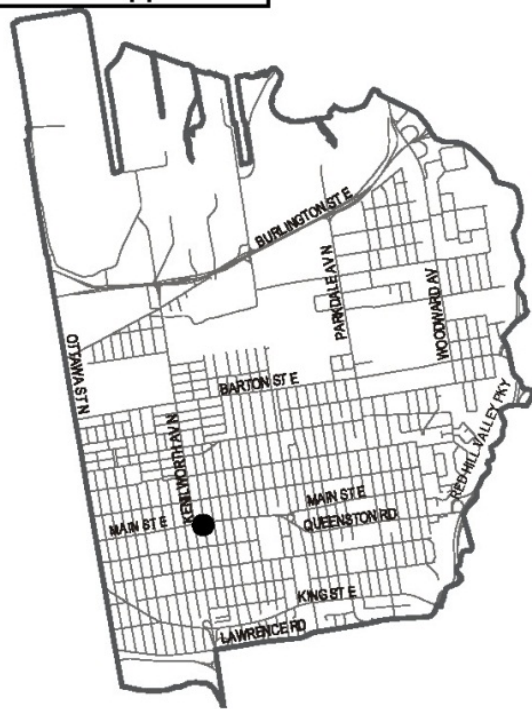
Ward 4 Key Map