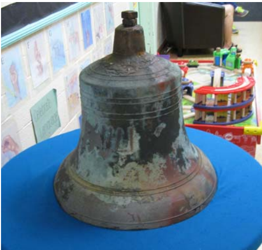
1876 school bell