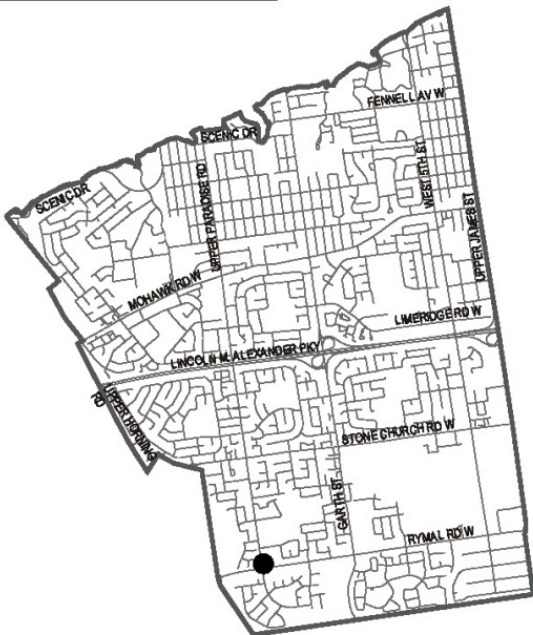
Ward 8 Key Map