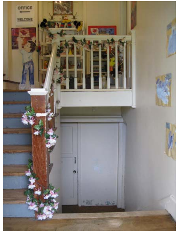
Interior of two front entrance