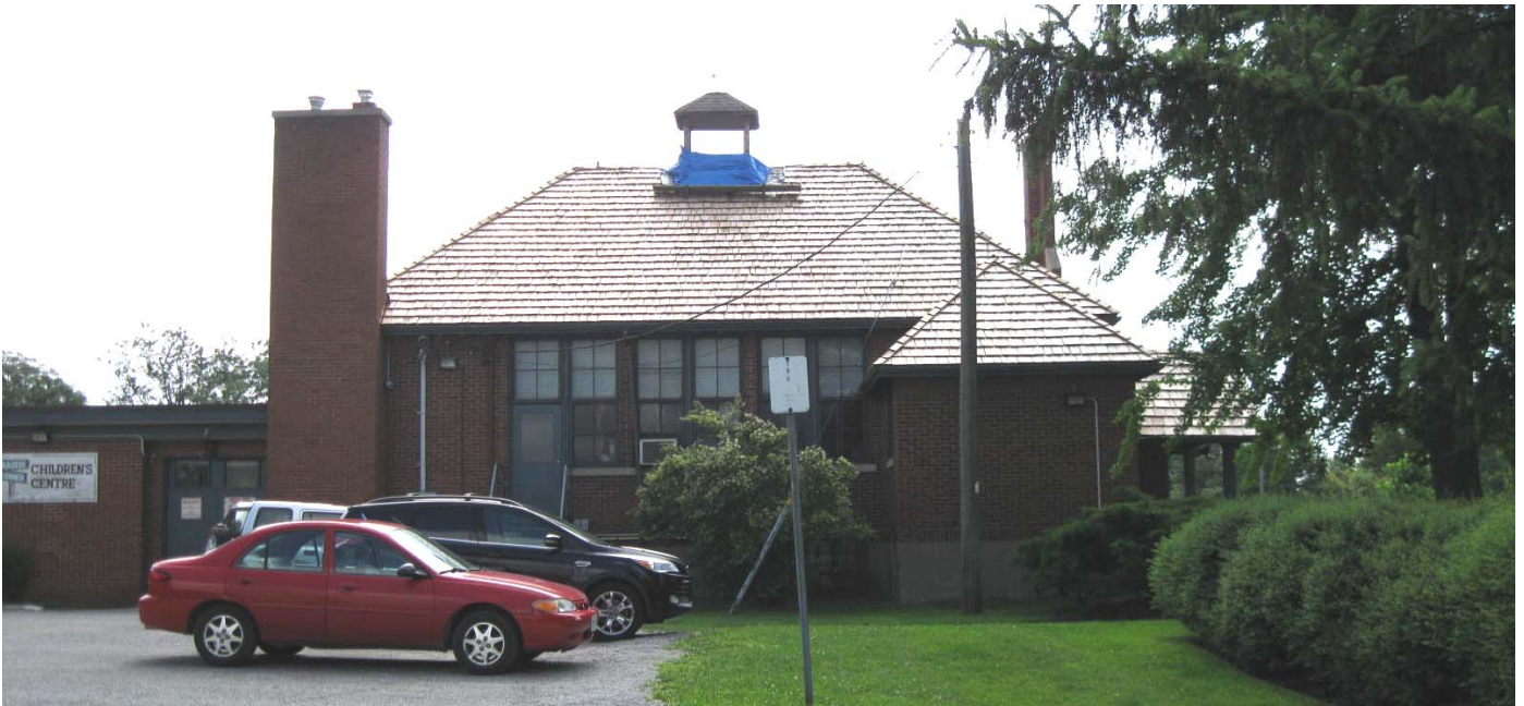
Side (west) façade (2013)