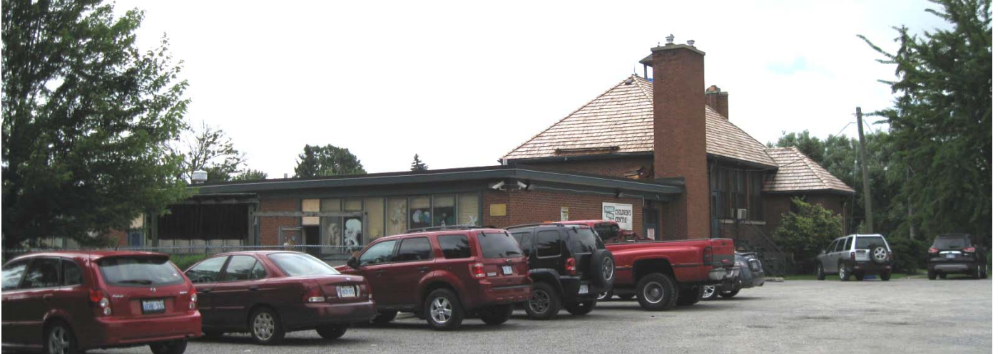
Rear (north) and side (west) façades with rear addition