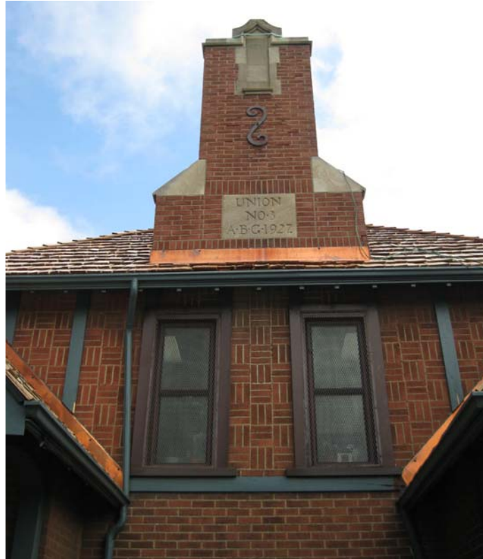
Front façade detailing and decorative parapet Window openings on either side of front entrance