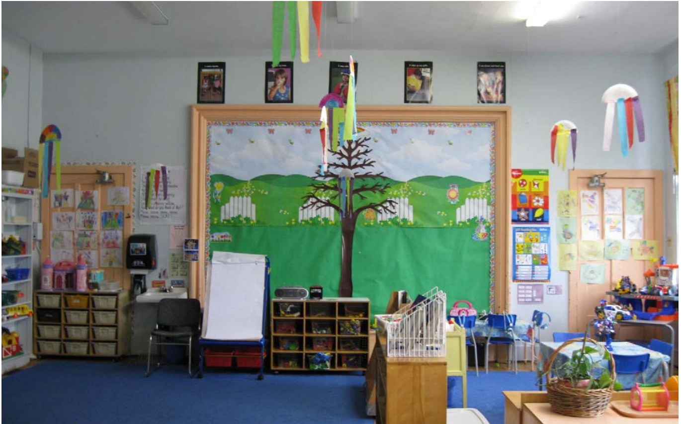
Interior of one-room school house, showing entrances and stage