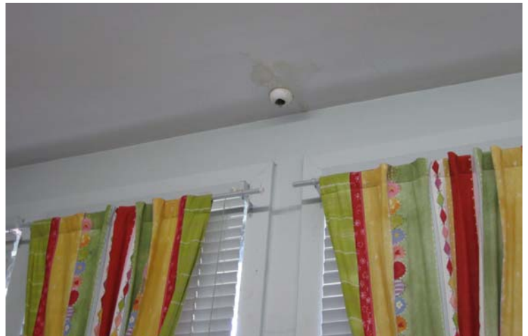
Hardware for bell pull in ceiling