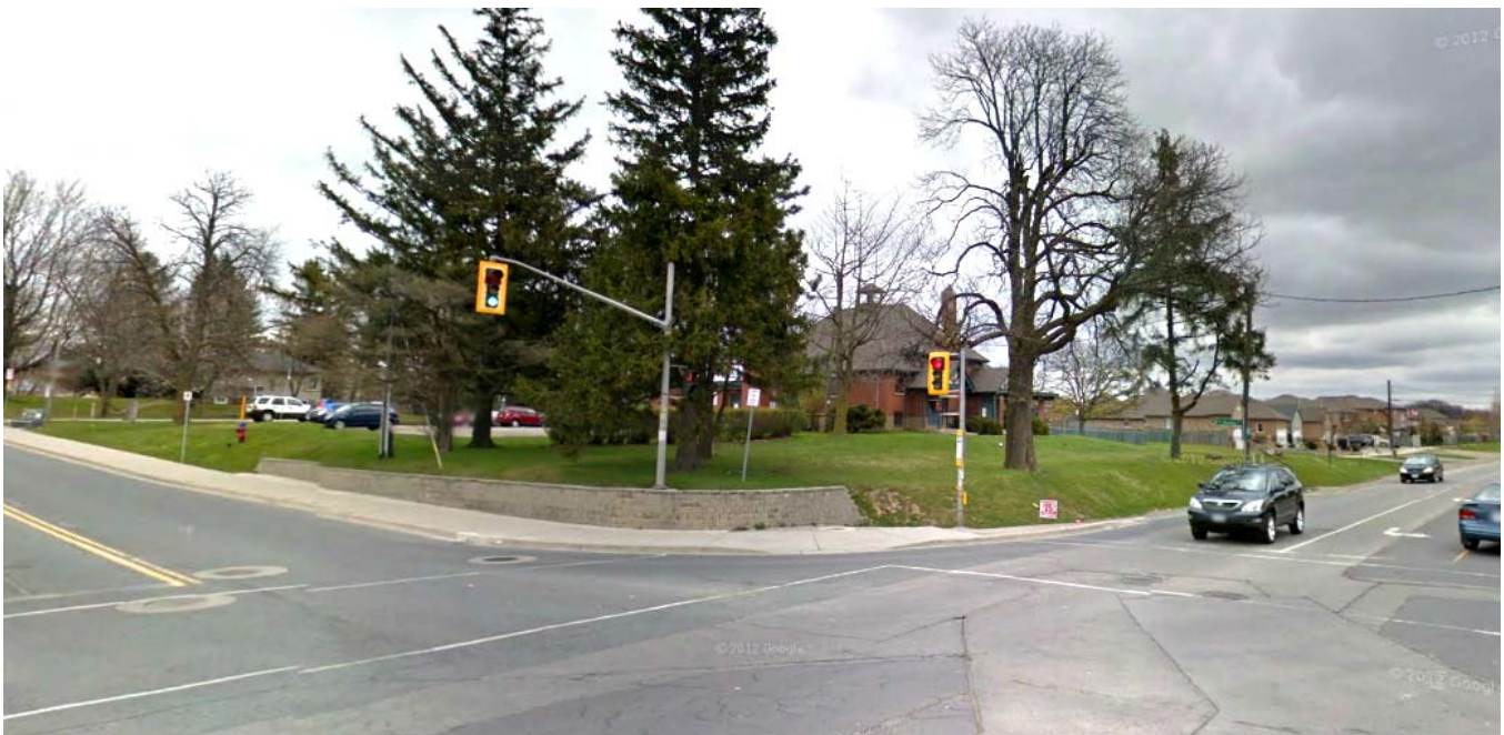
View of the property from the intersection of Rymal Road West and Upper Paradise Road