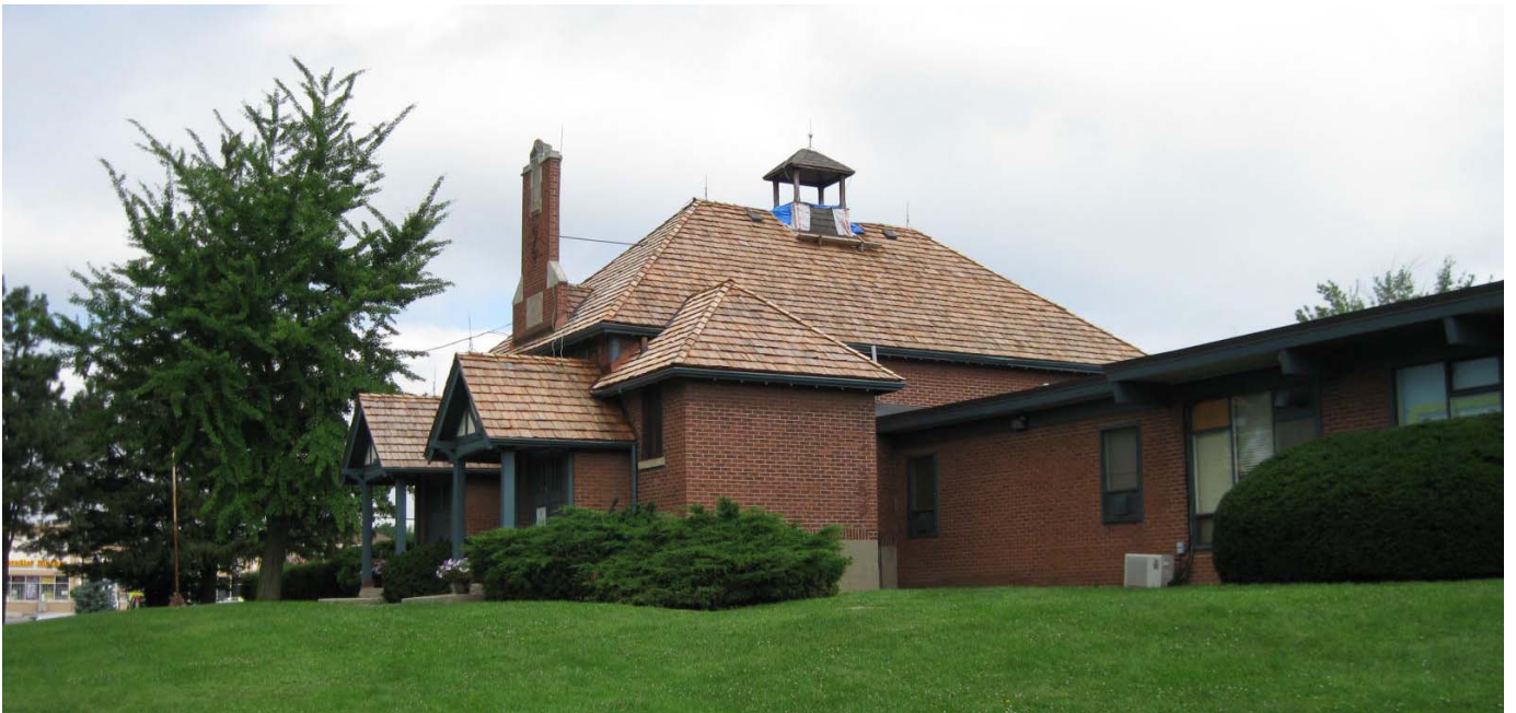
Front (south) and side (east) façades with side addition