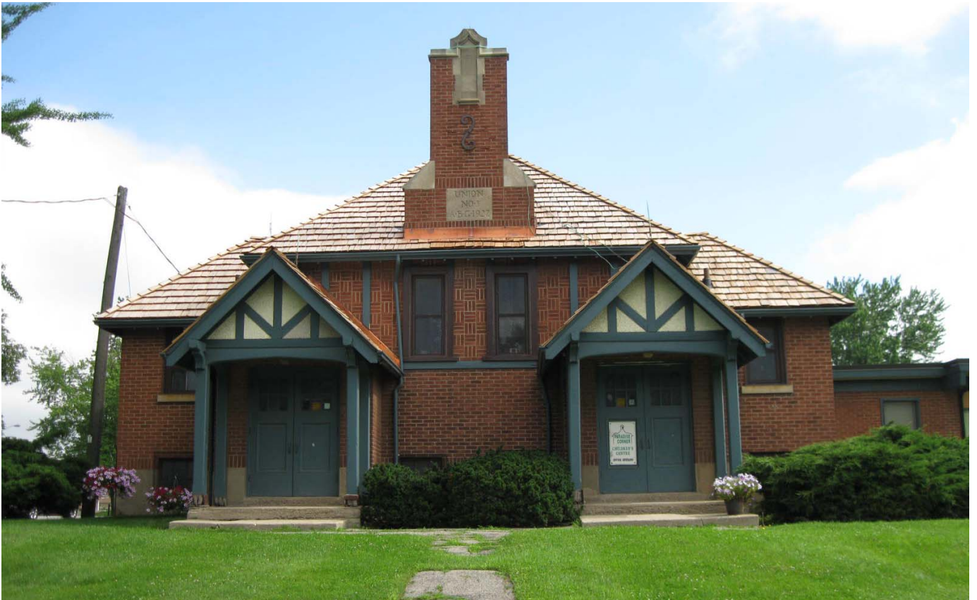
Front (south) façade