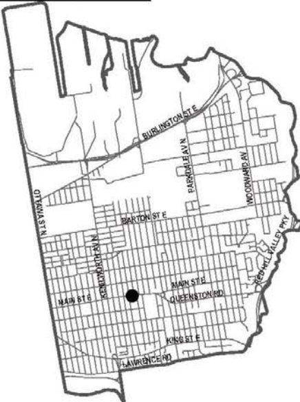
Ward 4 Key Map