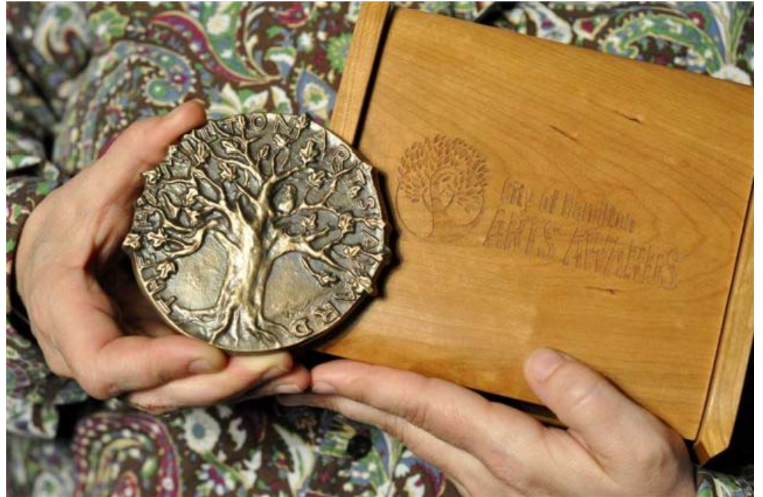
City of Hamilton Arts Awards medallion