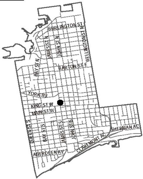
Ward 2 Key Map