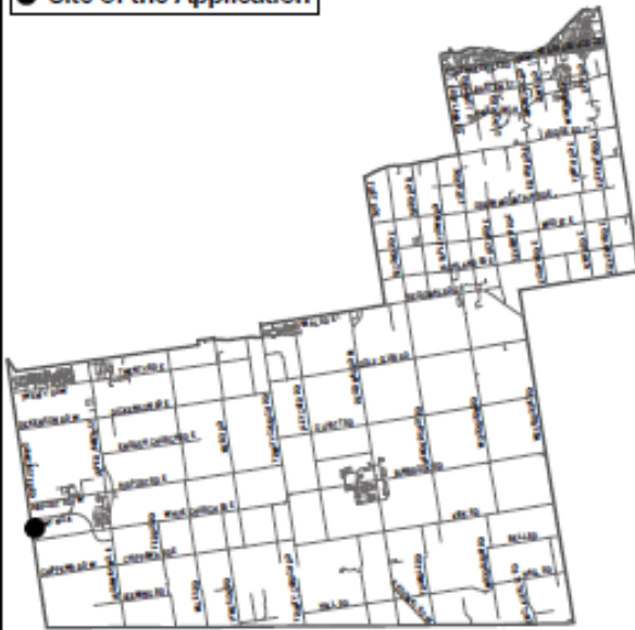
Ward 11 Key Map