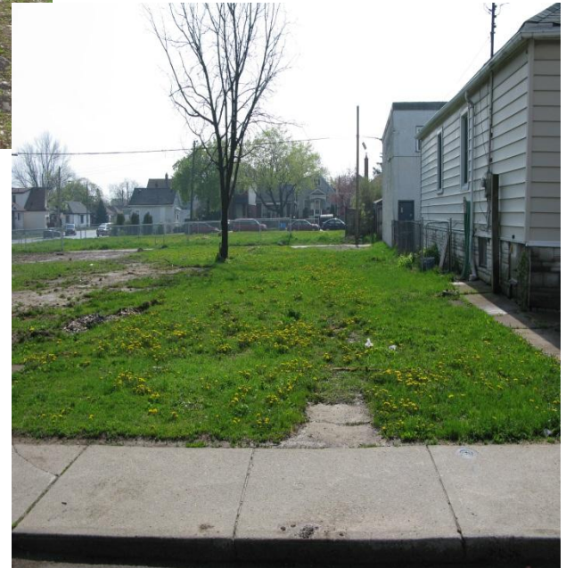
West end of new access to the alley – view from Province St North