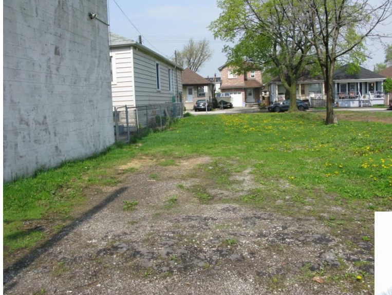
East end of new access to the alley – view from alley to Province St North