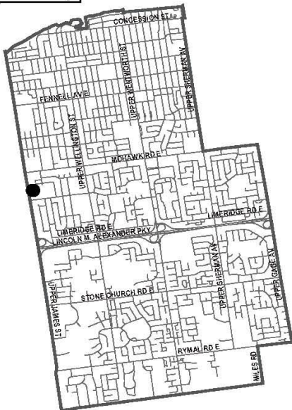
Ward 7 Key Map