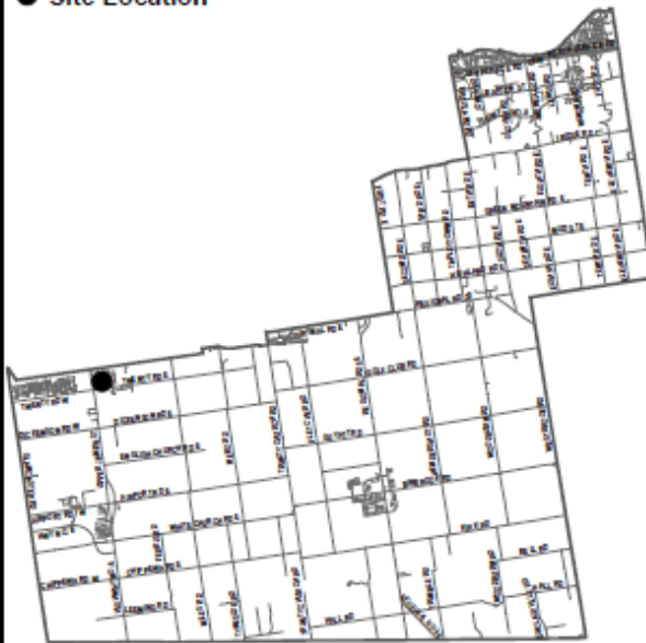
Key Map - Ward 11