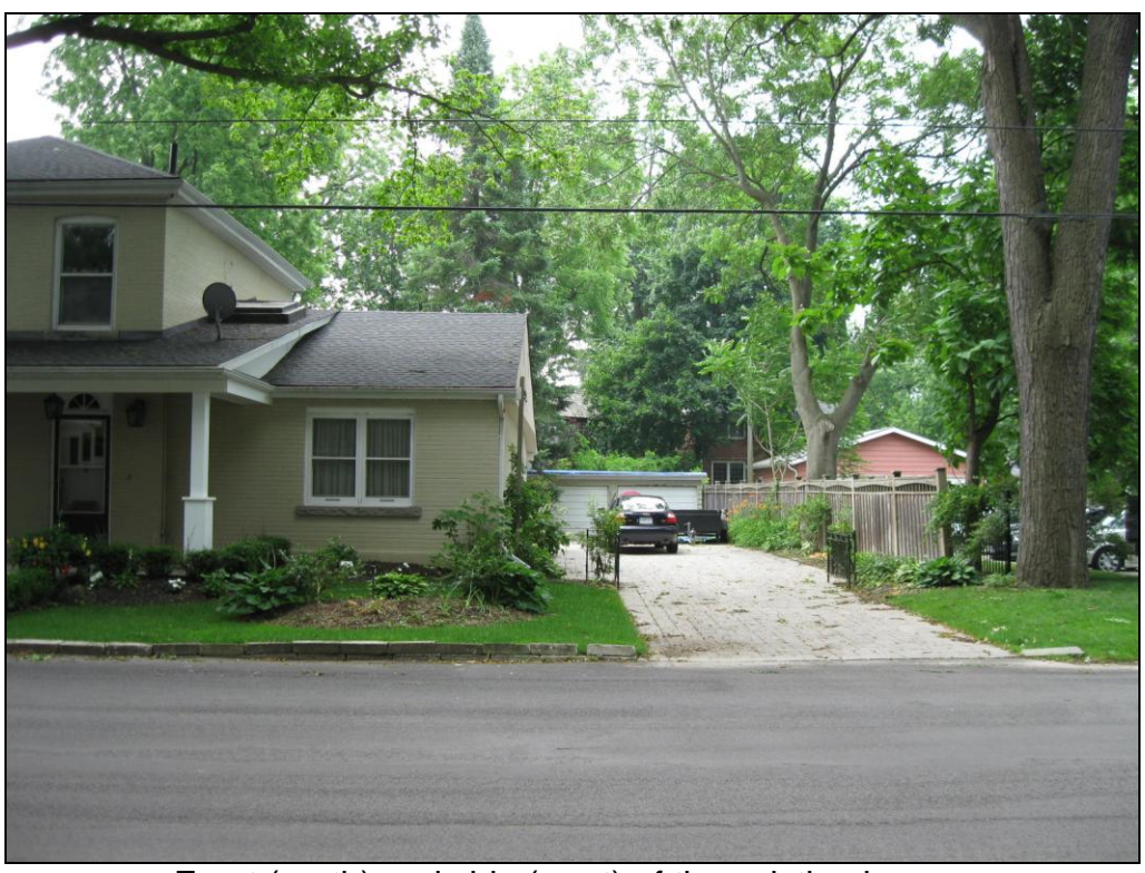
Front (north) and side (west) of the existing house, showing the existing detached garage and driveway