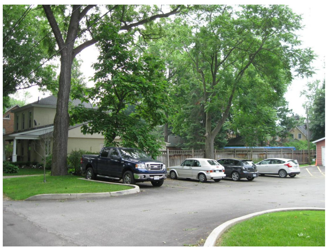
View of the property from the west, with the parking lot for Knox Presbyterian Church in the foreground (the roof of the existing garage is barely visible over the fence).