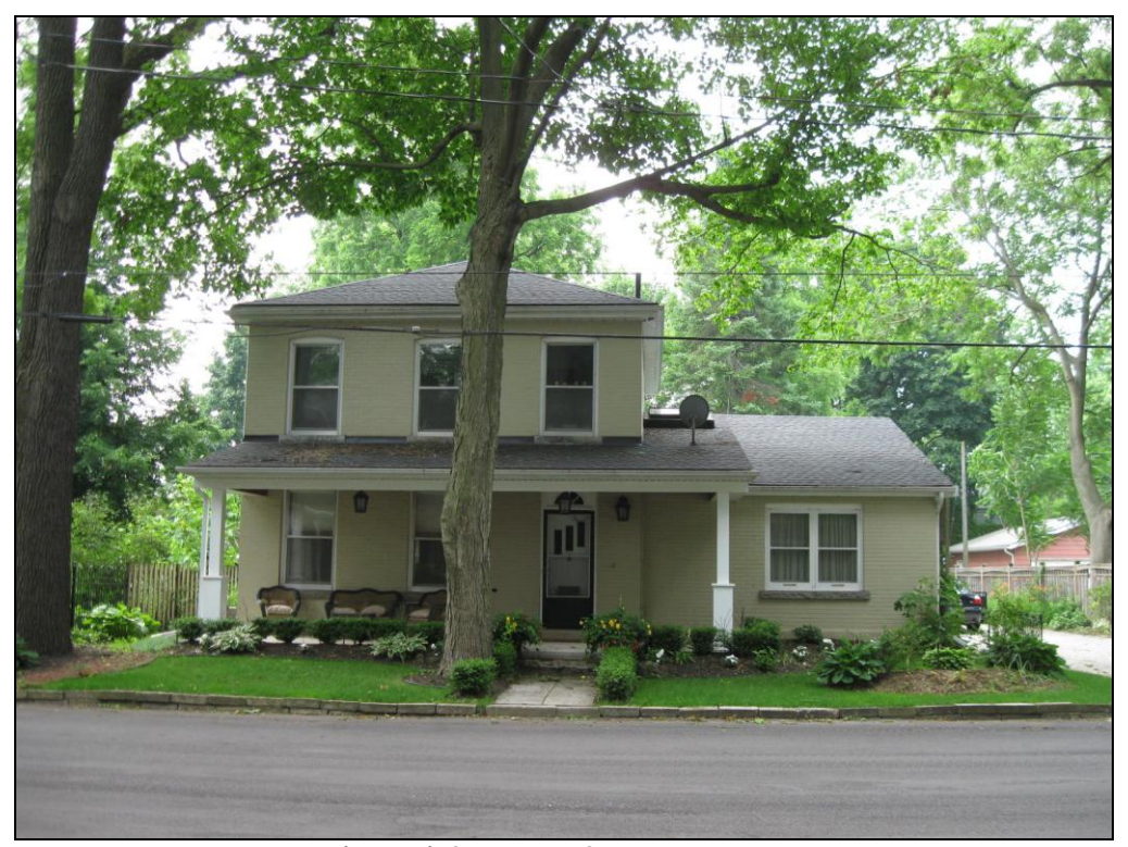
Front (north) façade of the existing house