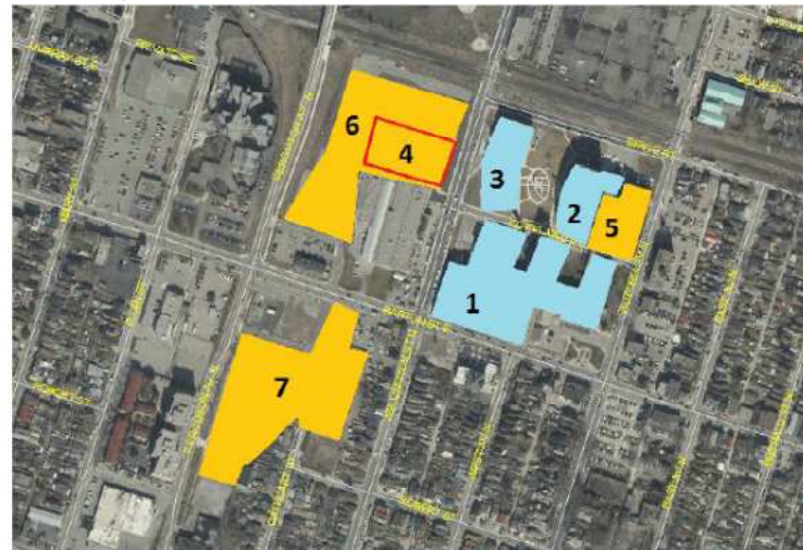
HHS Campus 2014