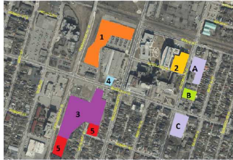
Existing and Proposed Parking Facilities – 2015