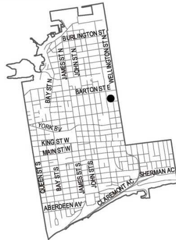
Key Map - Ward 2