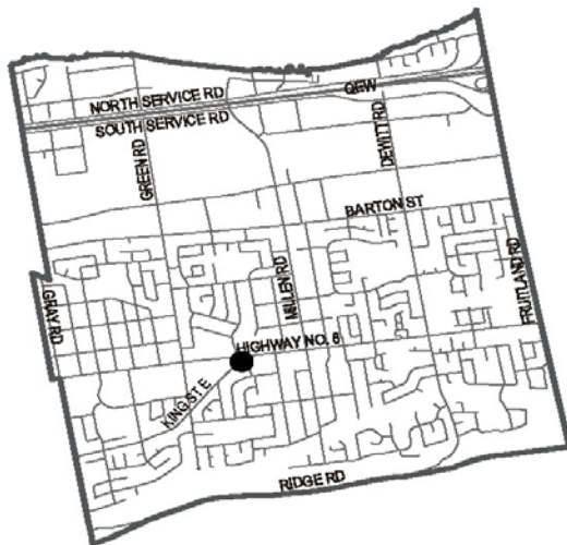
Key Map - Ward 10