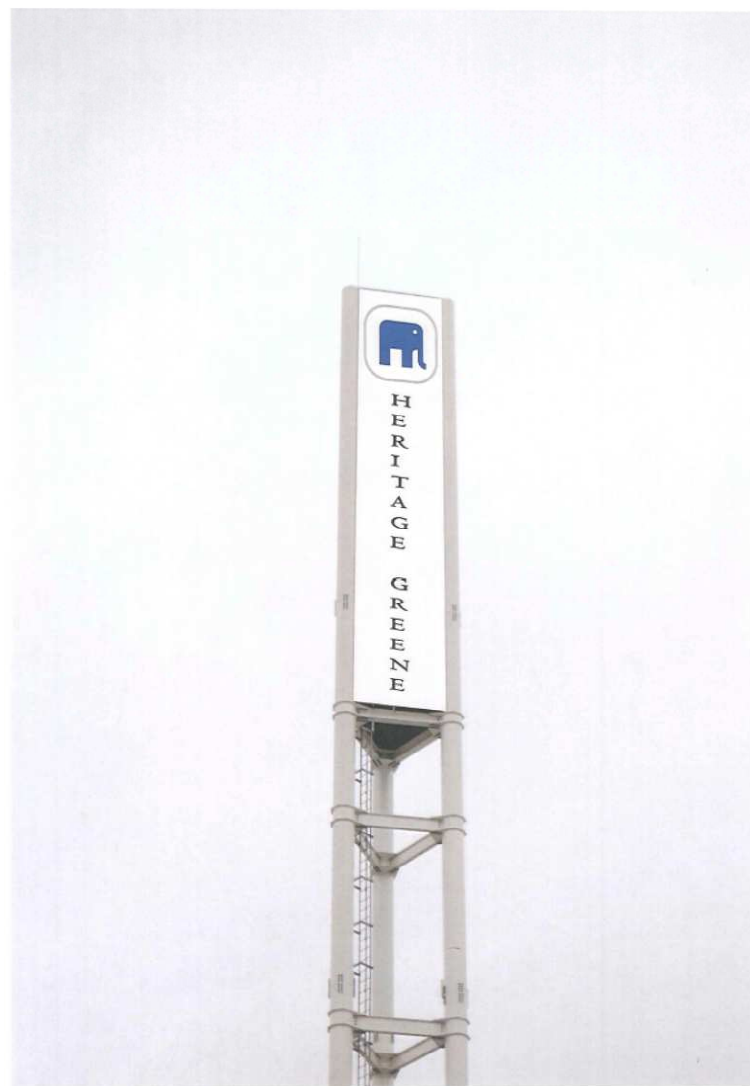
Bell PHOTOGRAPHIC SIMULATION W3217-1803 Stone Church Road