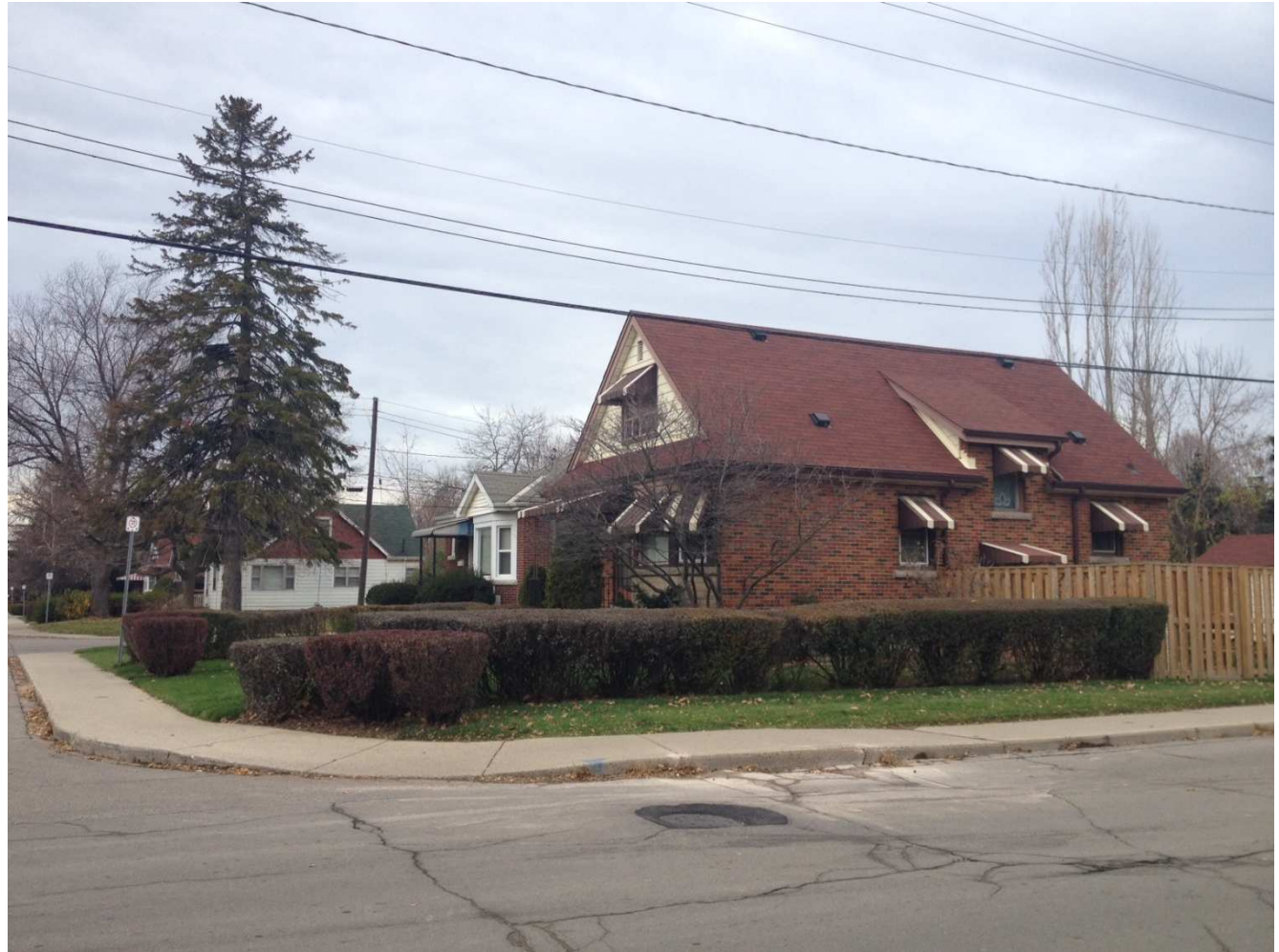
Photo 5 – West side of Leland Street across from the Subject Lands.