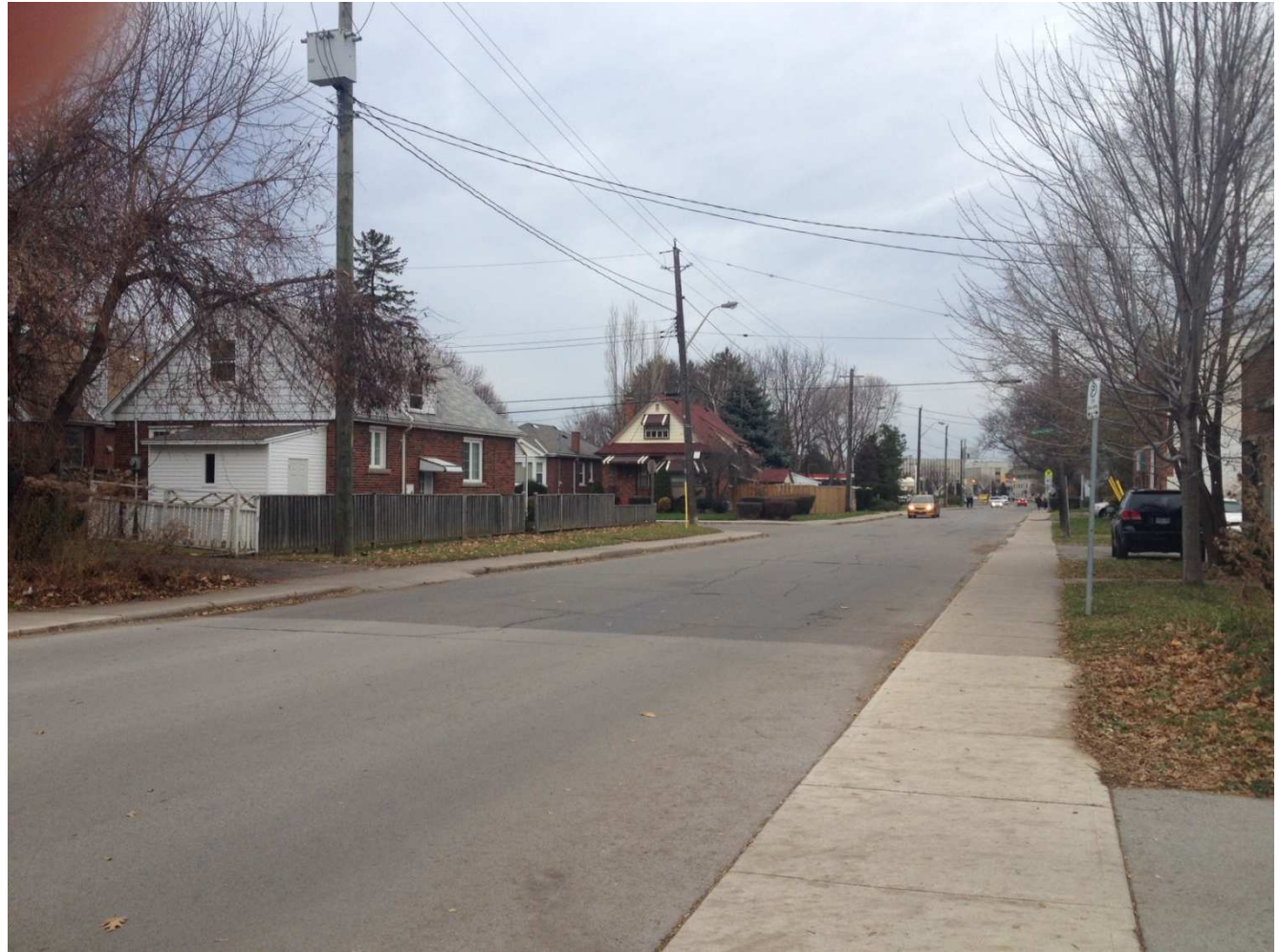
Photo 4 – West side of Leland Street across from the Subject Lands.