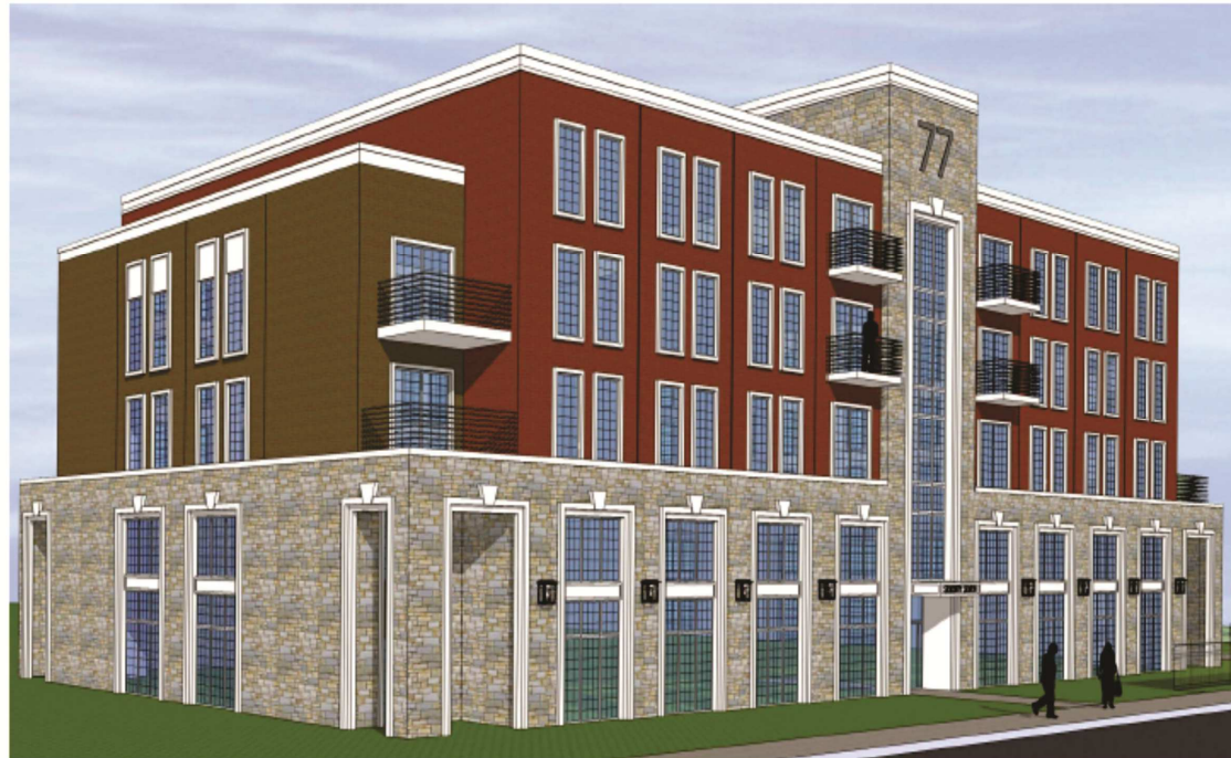
Perspective from North West