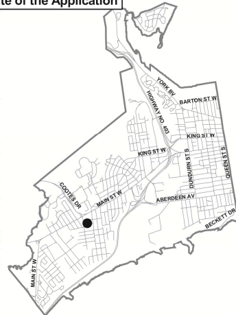
Ward 1 Key Map