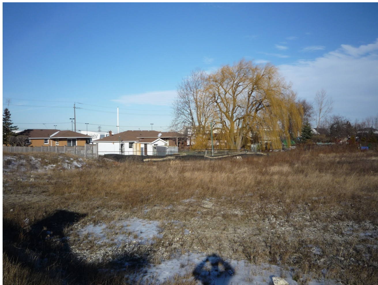
Photo 5 – North West view from Artfrank Drive towards rear of residences on Upper Mount Albion Road.