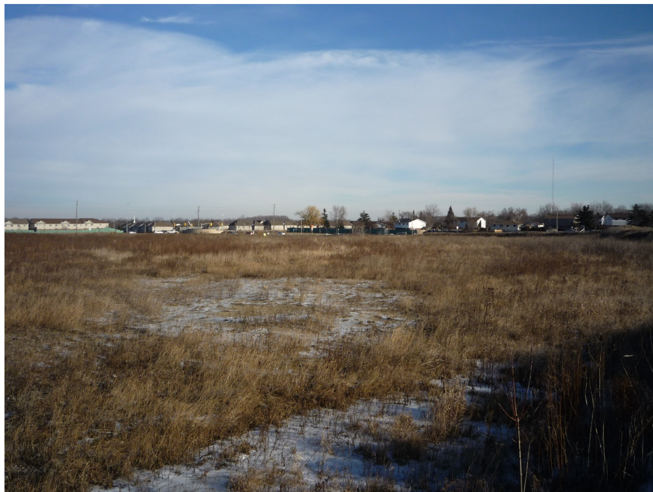
Photo 6 – North East view from Artfrank Drive towards Winterberry Drive.