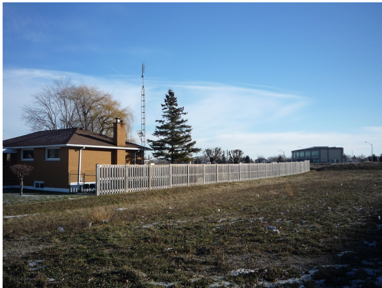
Photo 4 – North East view at the intersection of Upper Mount Albion Road and Artfrank Drive.