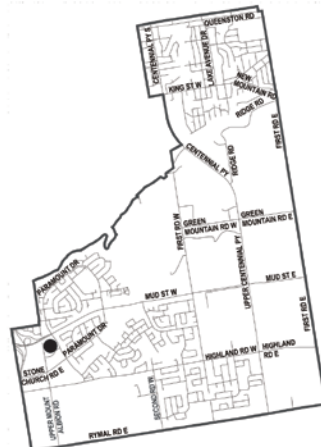
Key Map - Ward 9