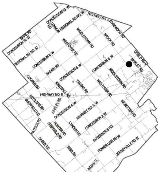
Ward 14 Key Map