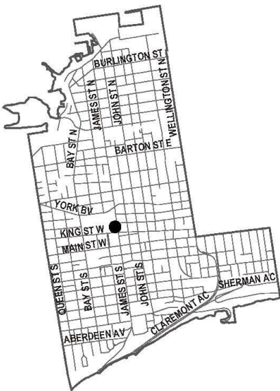
Key Map - Ward 2