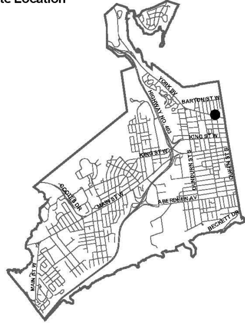
Key Map - Ward 1