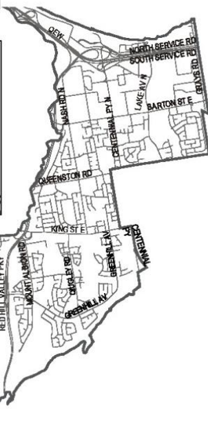
Ward 5 Key Map