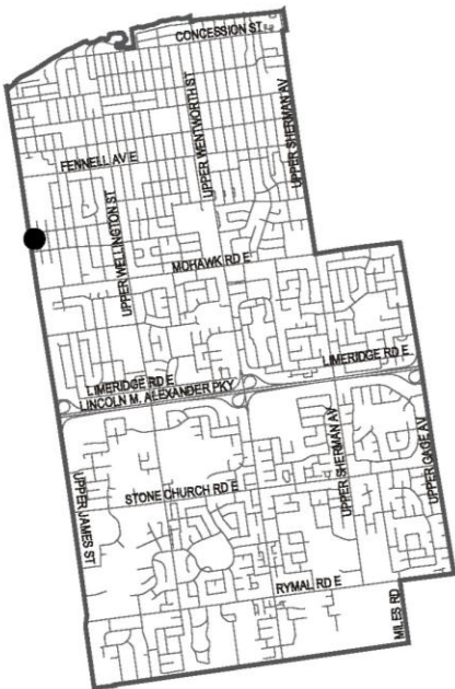
Key Map - Ward 7