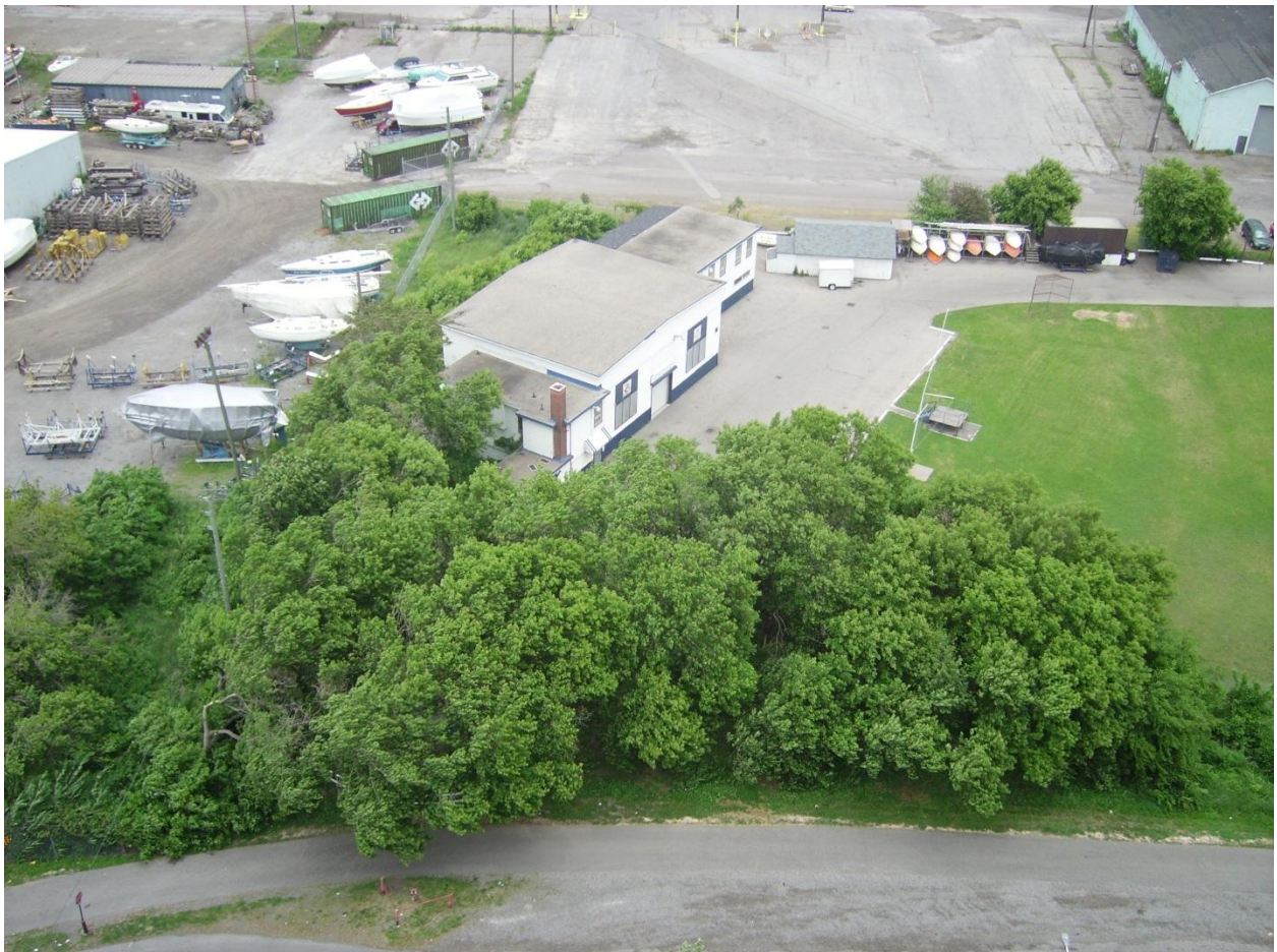
Below: Trees from intersection of John and Guise Streets, in front of the Sea Cadets and Navy League