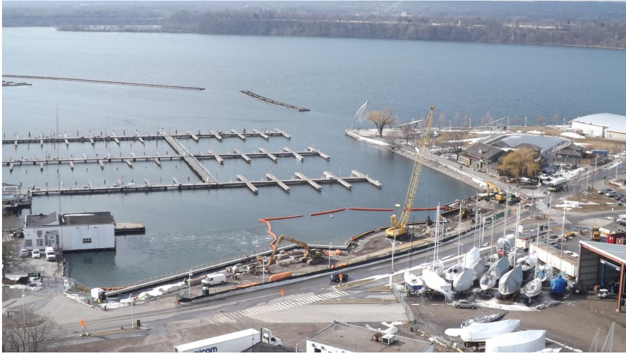
Below: New shoreline construction has eliminated mature trees.