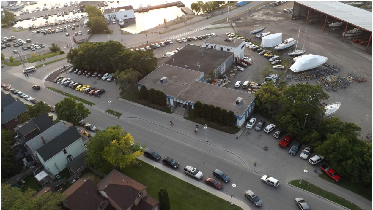
Above- Trees along the southern edge of Pier 8 from Discovery Drive at left